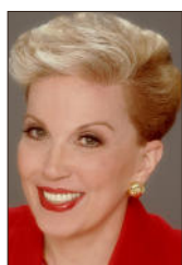
ABIGAIL VAN BUREN

DEAR Abby: My boyfriend and I are in our late 20s and have been together six years. He's a great boyfriend, and I'm happy in every way except one. Since we moved in together a year and a half ago, our sex life has dwindled down to practically zero. Sometimes we go months without it. We are busy with work and school, but I'm not sure if that's just an excuse. I know it's partly my fault because I should also take the initiative and not be lazy. I'm wondering if we're just not right for each other. Aren't the 20s supposed to be a time of sexual fun and frequency? Or does it even matter? Maybe we're just