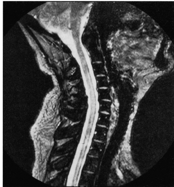
Figure 2. Magnetic resonance image of the spinal cord (T1-T5) showing resolving linear lesions to the left of the midline with resolving edema.

Acute disseminated encephalomyelitis following vaccination and various infections was first described