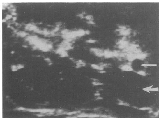
Fig 2 A transverse ultrasound study of the neck showing a mass consisting of multiple fluid filled spaces as evidenced by the lack of internal echoes, strong backwall, and increased through transmission of sound. There are solid elements within some of the fluid filled spaces. Thick arrow indicates jugular vein; thin arrow indicates carotid artery.

One week later the patient underwent a thoracotomy to debulk the remaining intrathoracic tumour. At surgery a large tumour posterior to the oesophagus was dissected from the superior vena cava, innominate artery and vein, as well as carotid and subclavian arteries. The tumour was found to extend into the vertebral foramina T4, T5, T6, and T8 and small remnants were left. The pathology of the tumour was similar to the previous biopsy specimen and showed a neuroblastoma with rare ganglionic differentiation.