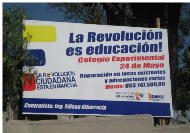
Figure 6.3 Billboard in Quito describing government support for structural improvements to secondary educational institution "Colegio 24 de Mayo"

These billboards describe a variety of projects supported or carried out directly by the government, and almost all of them describe the projects as being a direct result of the citizen revolution. The following figures contain examples of government billboard propaganda in a variety of locations throughout the country.