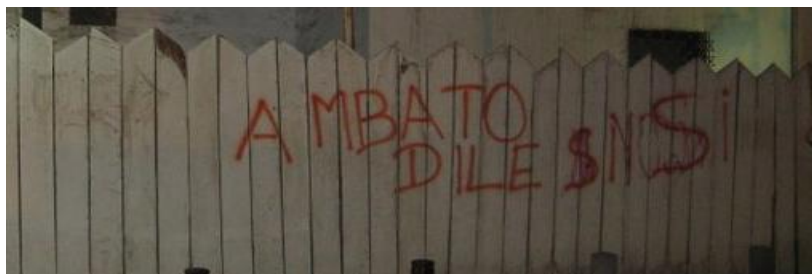
Figure 6.2 Referendum graffiti in the town of Ambato, Chimborazo province, Ecuador