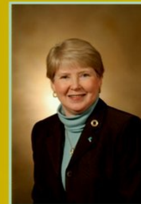
Tenure Track Faculty