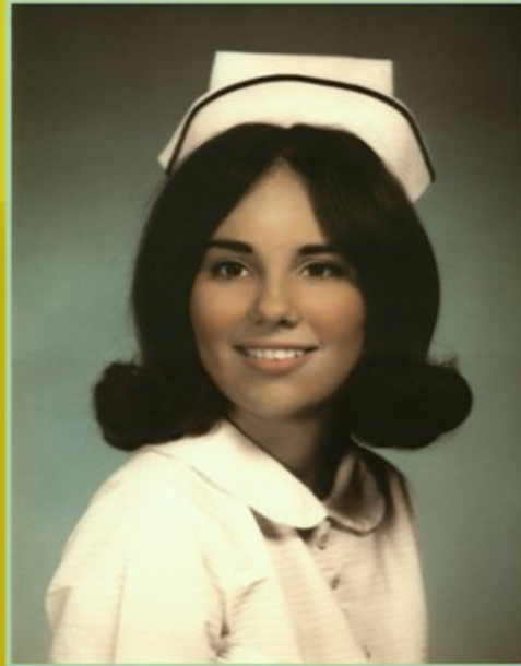
BSN, Michigan State