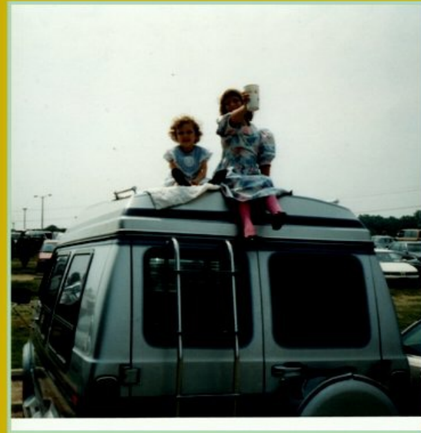
PhD, North Carolina State