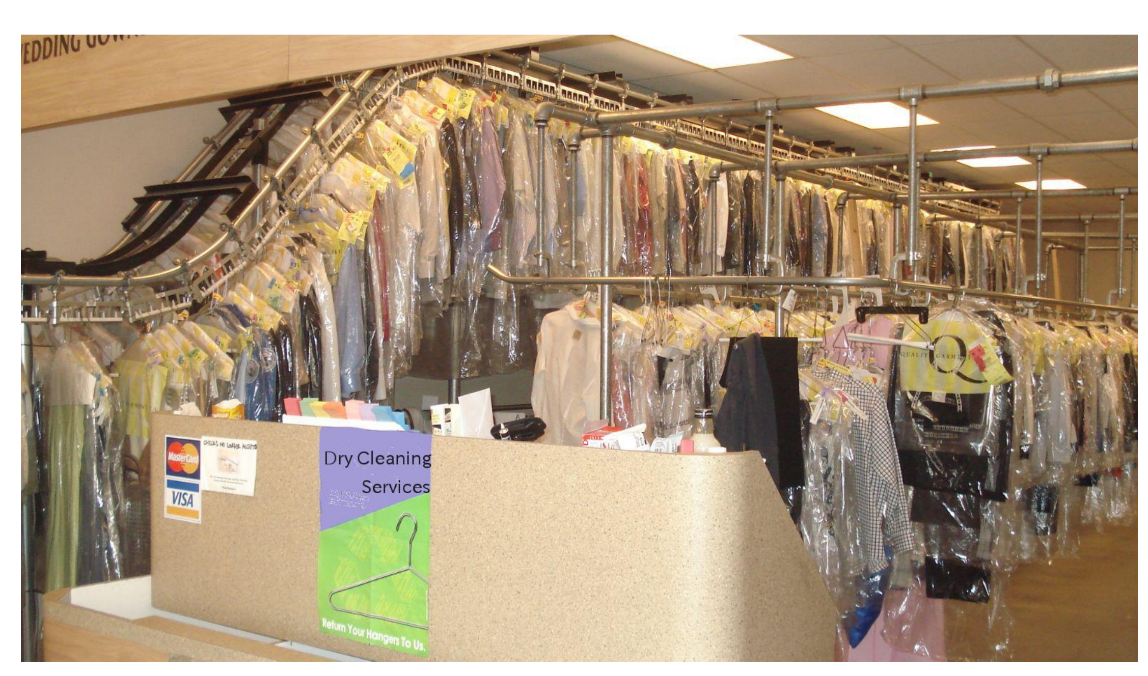
Figure 3. Dry cleaning facilities are a major producer of airborne perchloroethylene.

• Breakdown products of perchloroethylene can be measured in the blood and urine.