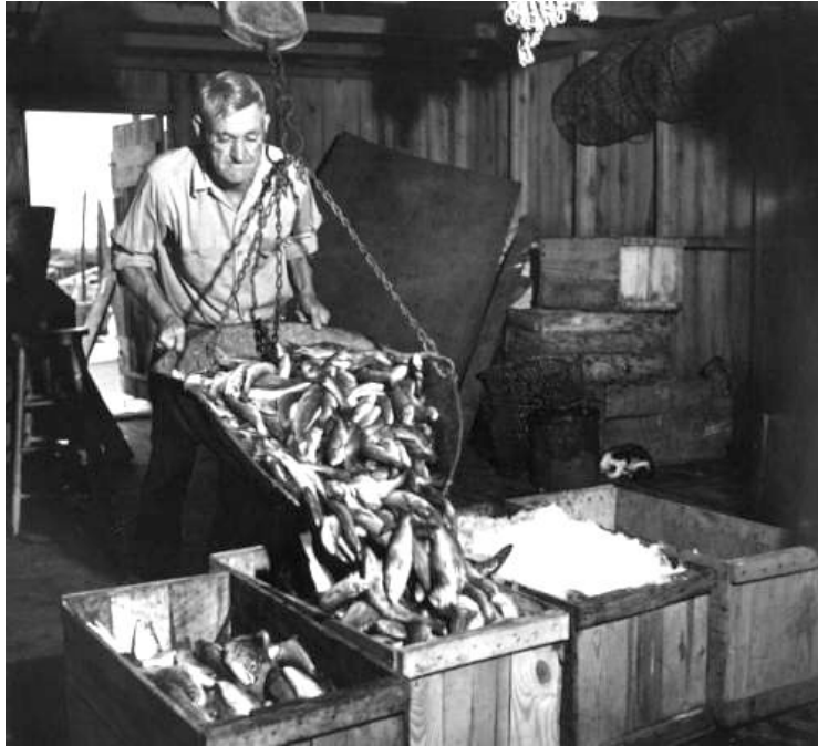
Fig. 14 Weighing and Packing Fish, Cape Hatteras 1945.