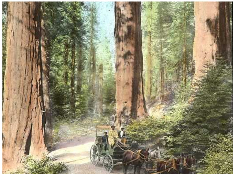
Fig. 2 Sequoia National Park, c.1890 ( Stage Coach Travel , 1890s, Historic Photos Collection, National Park Service, Harpers Ferry Center, WV)

citizens the opportunity to experience these sources of pride.