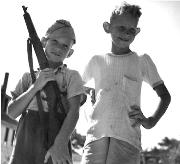
Fig. 8 Hunting for Game, 1945 Cape Hatteras

One early challenge, faced by the commission, was a failure to mention hunting rights of the residents in the original establishment act. Traditionally, national parks did not allow hunting within their boundaries. The push to establish a national seashore on the North Carolina Outer Banks was an attempt to create a new kind of park that provided recreational opportunities in addition to conserving scenic areas. The idea was that the recreational aspect would include