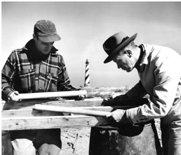
Fig. 12 Examining Cores, 1945, Hatteras Island.

The lack of a road to Hatteras made it difficult to transport the large equipment to the site. The equipment was shipped from Oklahoma by railroad and placed on a barge in Elizabeth City. 175 It traveled through the Albemarle Sound and Pamlico Sound to a channel dug specifically for Standard Oil. The equipment arrived at a dock, also constructed specifically for