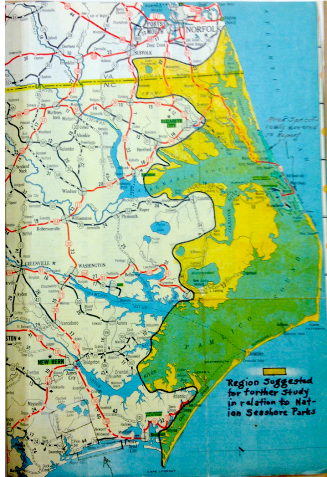
Fig.6 Potential Park Land, 1930s. (Louis P. Croft, “Study for a National Seashore Park Covering in a General Way the Region From Virginia Beach to Hatteras Island and the Dismal Swamp and Specifically Reporting on the Area From Kitty Hawk to Ocracoke Inlet,” CAHA 5417, Box 9, Folder 8, Early Establishment Records, Fort Raleigh, Manteo, N.C.)

study analyzed the area from Virginia Beach to Hatteras Inlet and included the Dismal Swamp. Croft favored developing the area for a national park on the basis of a large amount of water to provide fishing and boating opportunities. He felt that the large sounds and isolated beach would be an asset to the NPS. Croft wrote "...water seems to be everywhere— and it is not difficult to imagine, the waves rolling over to the sound—in the writer’s opinion, there is a place in our national park system for a type of topography capable of producing such an experience.” 82