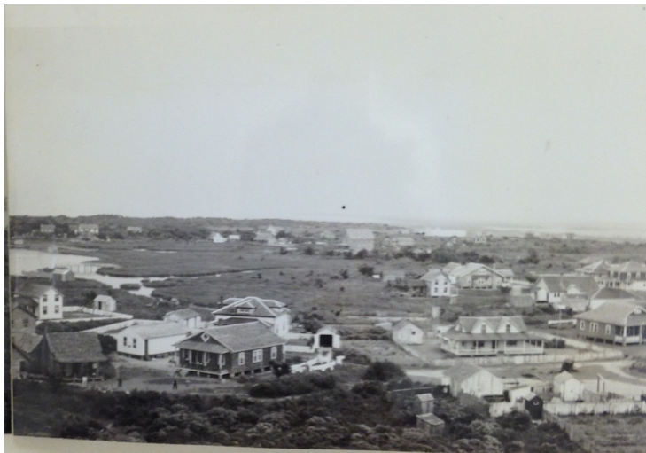
Fig. 17 Village of Ocracoke, 1937 (“Report on Recommendations for Boundaries of the Cape Hatteras National Seashore,” December 1937, CAHA 5417, Box 1, Folder 3, Early Establishment Records, Fort Raleigh, Manteo, N.C.)

The report detailed the estimated cost to acquire the land for CHNS and broke the figures down by islands. Ocracoke would be the easiest land to acquire; there had been very few real