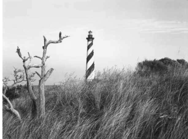
Fig. 16 Cape Hatteras Lighthouse, 1945.

After touring the area, a five-hour conference was held with North Carolina State Attorney General Harry McMullan to discuss the possible ways to handle Cape Hatteras State Park. It was determined that Bankers were confused about the park project and they should not transfer any state lands until the majority of the residents were in favor of it. Ross declared, “No lands on Hatteras Island will be ceded to the National Park Service, without the expressed approval of the people of the island.” 201