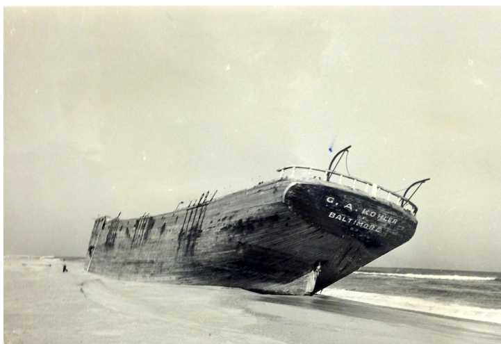
Fig. 9 A Hurricane Wrecked the G.A. Kohler in 1933. (“Report on Recommendations for Boundaries of the Cape Hatteras National Seashore,” December 1937, CAHA 5417, Box 1, Folder 3, Early Establishment Records, Fort Raleigh, Manteo, N.C.)

Another major obstacle the CHNS Commission faced was a lack of clear boundaries in land titles. The CHNS was, initially, to be formed from three counties, Hyde, Dare, and Currituck. Hyde County had a courthouse fire in the early 1800s that destroyed many of their records. Dare County had been partially formed from Hyde County in 1870. 111 In addition to these complications, many of the boundary landmarks had been lost to erosion. 112 Multiple deeds gave shipwrecks as points to mark boundaries. Shifting sands moved shipwrecks,