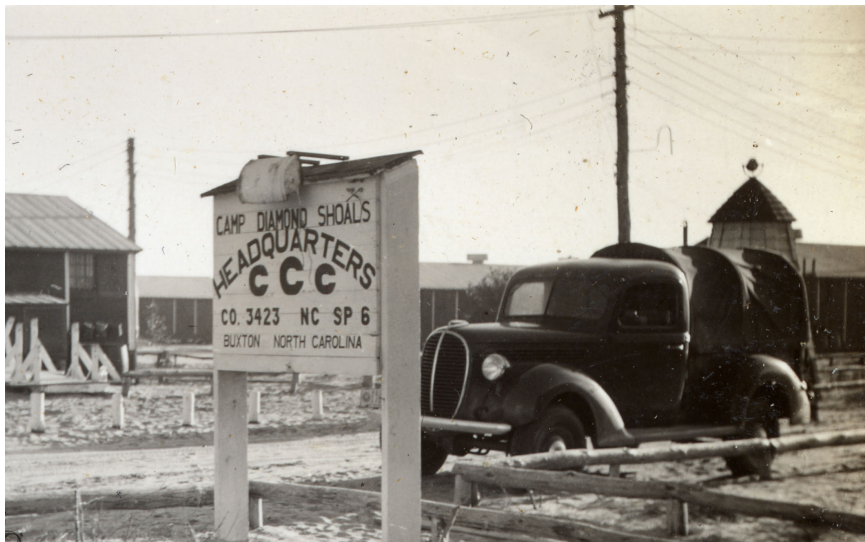
Fig.7 CCC Camp near Buxton, 1940.

The creation of a state park prompted the arrival of federal aid to make improvements to the region. The Civilian Conservation Corps (CCC), part of the New Deal program created under the Roosevelt administration, began work on the Outer Banks. The purpose of the CCC was to make improvements to state and national parks. The CCC of the Outer Banks focused on beach erosion and appeared to make outstanding progress in stabilizing the beach. Not only did the efforts of the CCC seem to provide erosion protection for the homes, but also their work would,