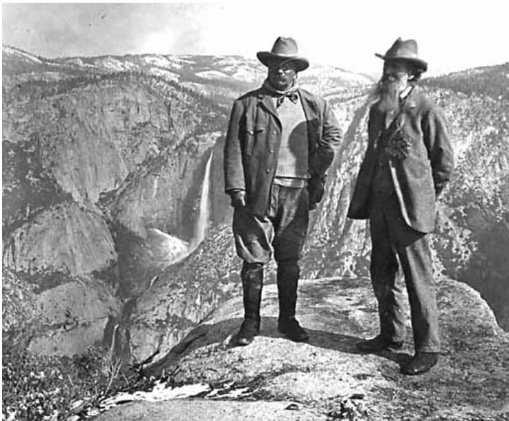
Fig. 4 Theodore Roosevelt and John Muir, 1906, Yosemite Valley, California. ( Theodore Roosevelt and John Muir on Glacier Point, Yosemite Valley, California, 1906 , Historic Photos Collection, National Park Service, Harpers Ferry Center, WV)

Yosemite, Sequoia, and General Grant National Parks were the first permanent parks established within nearly twenty years of the creation of Yellowstone. 45 Congressional action continued to be the only avenue to have land areas designated as national parks, and Congress would only authorize a park if they could be convinced the land was worthless. Since parks were preserved for aesthetic purposes, Congress wanted to be certain that no economic benefit could be found on the land. 46 Most of the parks preserved were uninhabitable and lacked mineral