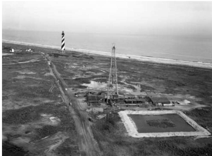
Fig. 11 Drilling for Oil on Hatteras Island. [ULPA SONJ 30750, Standard Oil (New Jersey) Collection, Photographic Archives, University of Louisville, Louisville, Kentucky.]

Approximately twenty technicians came to the island with the equipment and additional men were hired from local