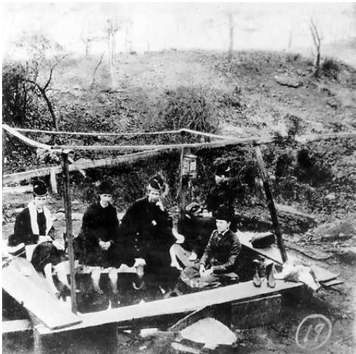
Fig. 3 Hot Springs Reservation, 1870 (Deluxe Studios, Corn Hole—Ladies’ Hour , 1870, Historic Photos Collection, National Park Service, Harpers Ferry Center, WV)

Niagara Falls, one of the United States’ first tourist attractions, was completely overrun by commercialization on the American side by 1860. There were no spots available for people to view the falls without paying a fee to one of the many fortune hunters. Private entrepreneurs had seized the opportunity to make money by capitalizing on this grand and magnificent natural