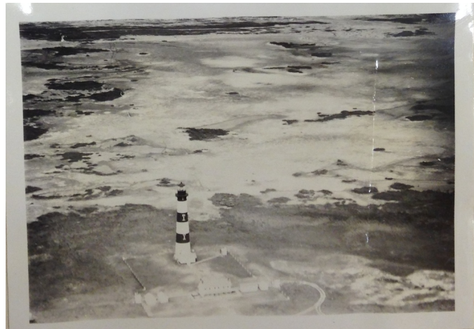
Fig. 18 Bodie Island Lighthouse, 1937

("Report on Recommendations for Boundaries of the Cape Hatteras National Seashore," December 1937, CAHA 5417, Box 1, Folder 3, Early Establishment Records, Fort Raleigh, Manteo, N.C.)