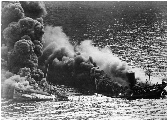
Fig. 10 The Dixie Arrow was attacked near Cape Hatteras in 1942. (“Torpedo Junction – History and Culture,” Learn About the Park: Cape Hatteras National Seashore, National Park Service: U.S. Department of Interior, December 1, 2015, http://www.nps.gov/articles/wwii_caha_torpedo_junction.htm )

Actually, it was just the beginning. According to reports, approximately 397 merchant vessels were destroyed off the Atlantic coast during World War II and nearly five thousand lives were lost. 133 Historian David Stick reported that the North Carolina Coast saw eighty-seven