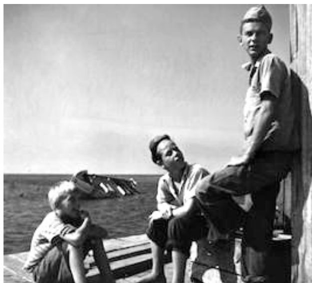
Fig. 19 Planning the Next Adventure, Cape Hatteras 1945.

Finally, on January 12, 1953, the Secretary of the Interior signed the order that officially placed Cape Hatteras National Seashore under the authority of the National Park System. 252 More than fifteen years had passed since Congress had authorized the establishment of the nation’s first National Seashore. It would be another fifteen years before the court cases contesting condemnation would be resolved.