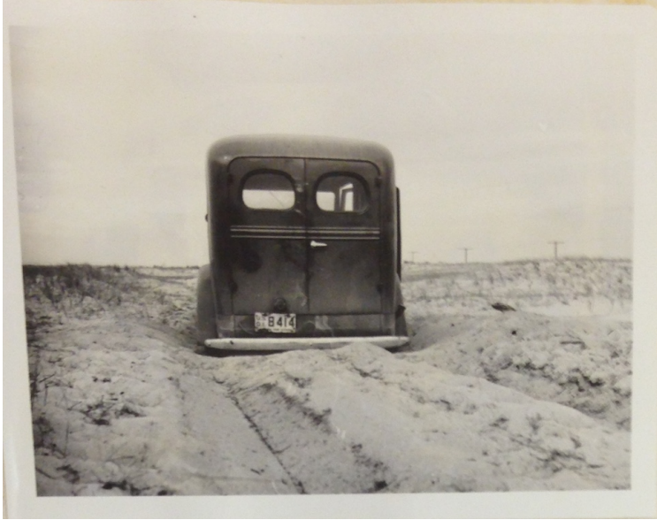
Fig. 13 Outer Banks Road, 1937.

(“Report on Recommendations for Boundaries of the Cape Hatteras National Seashore,” December 1937, CAHA 5417, Box 1, Folder 3, Early Establishment Records, Fort Raleigh, Manteo, N.C.)