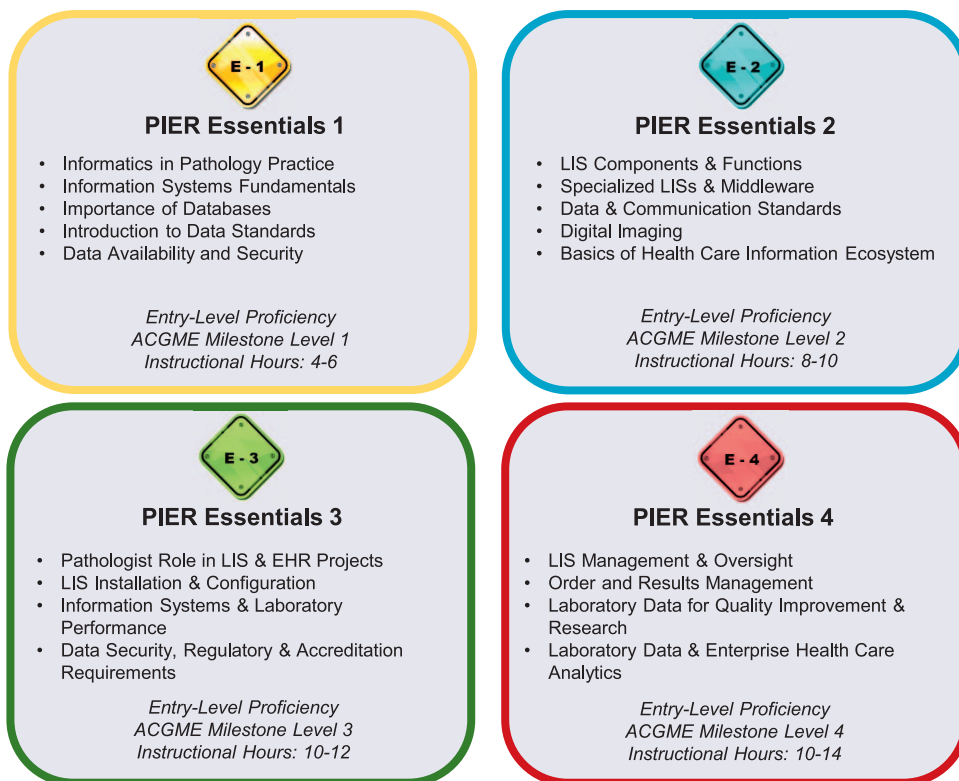
Figure 1. Pathology Informatics Essentials for Residents – Curriculum Scope and Sequence (PIER Release 1). Abbreviations: ACGME, Accreditation Council for Graduate Medical Education; EHR, electronic health record; LIS, laboratory information systems; PIER, Pathology Informatics Essentials for Residents.