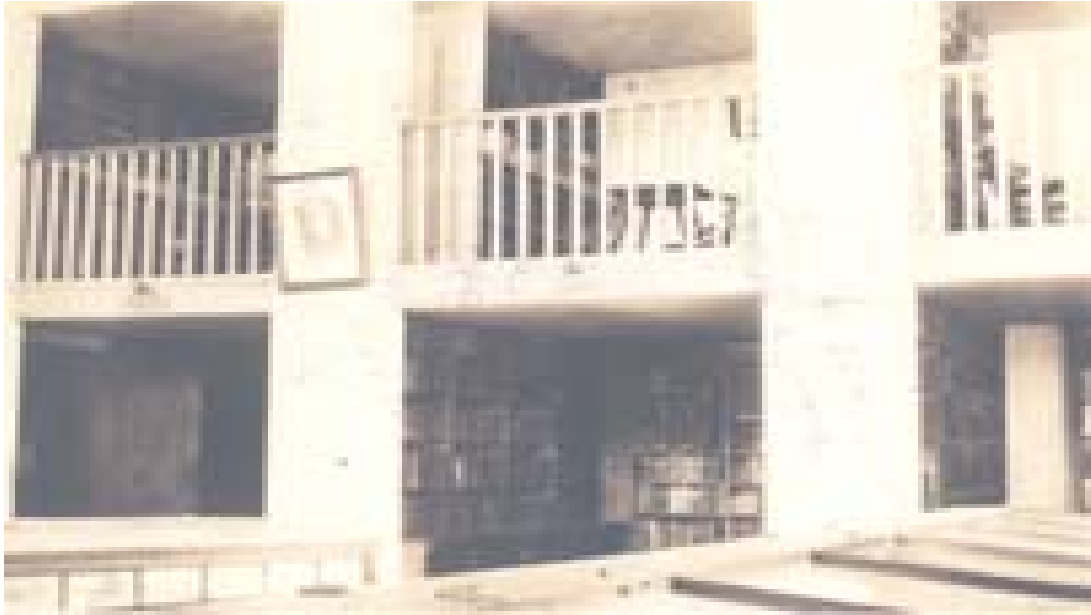
Figure 2: In 1860 Davidson moved its library into the new and very impressive Chambers Hall designed by Alexander Jackson Davis of New York. Date of picture unknown.