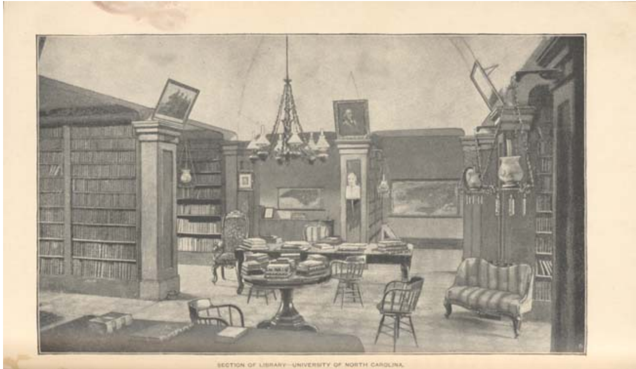
Figure 3: Another idealized image of library furnishings, from the 1880s. From Charles Lee Smith, The History of Education in North Carolina (Washington: Government Printing Office, 1888), 52a. University of North Carolina, “Documenting the American South.” http://docsouth.unc.edu/true/smith/ill7.html

College libraries in North Carolina were assemblages of books and magazines with minimal organization or cataloging. They were not imaginary but neither were they substantial, and in this were not too dissimilar from college libraries in the North or, for that matter, in France or Britain. 46 The lack of significant libraries hardly fed the meager Southern intellectual establishment and it is noticeable that no leading literary works or magazines originated with Southern colleges. Library equipment and furnishings were almost non-existent, while collection development, reference and research services all waited for the future. 47 Near the end of our period, a student at the University of North Carolina concluded, “If Rip Van Winkle wants ... libraries which shall command the attention of good talents, he must wake up.” 48