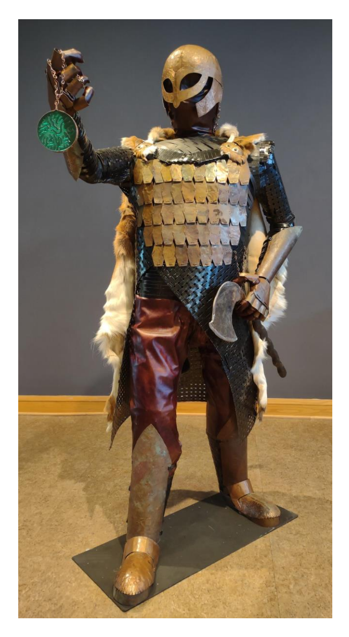
Plate 9: Ayon, 6' 2" x 31" x 37", steel, copper, mesh wire, plaster gauze, fabric, and leather, 2023