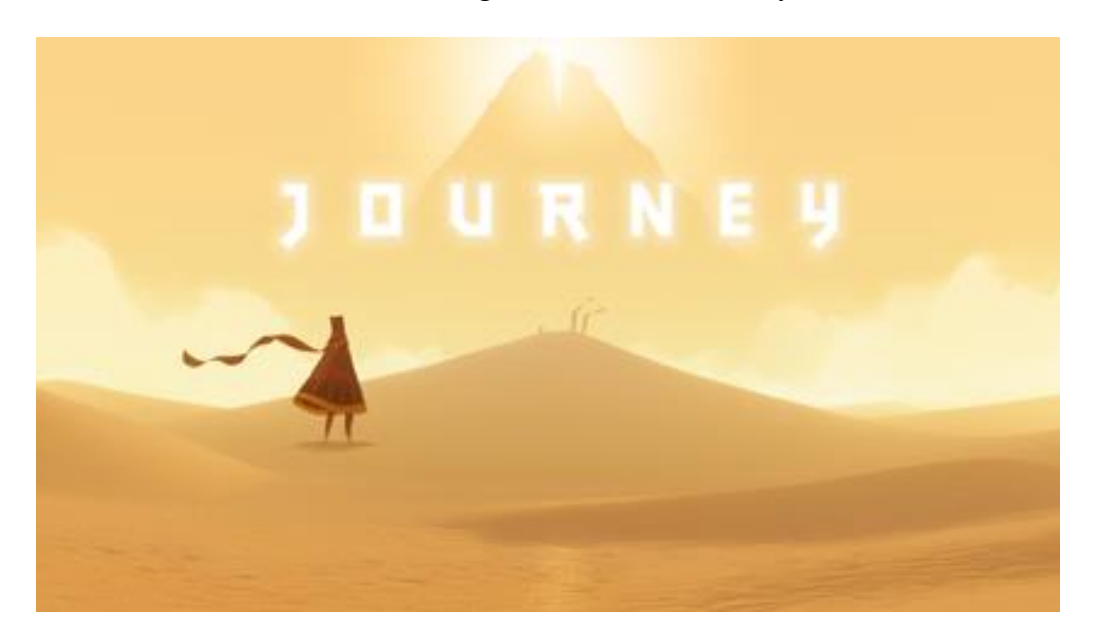
Figure 2: Journey (2012)

metaphor regarding the concept of spirituality and scientific processes involving evolutionary theory. The game is ultimately a modern mythological story that follows Campbell's story structure as each level is named after a stage in the Hero's Journey.