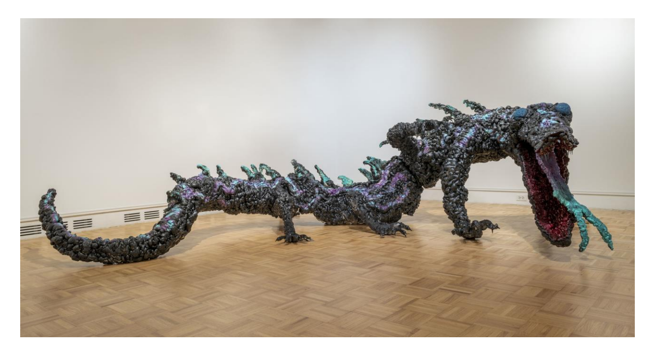
Plate 7: Gorathel, 50" x 6' x 16', steel, mesh wire, and spray foam, 2023