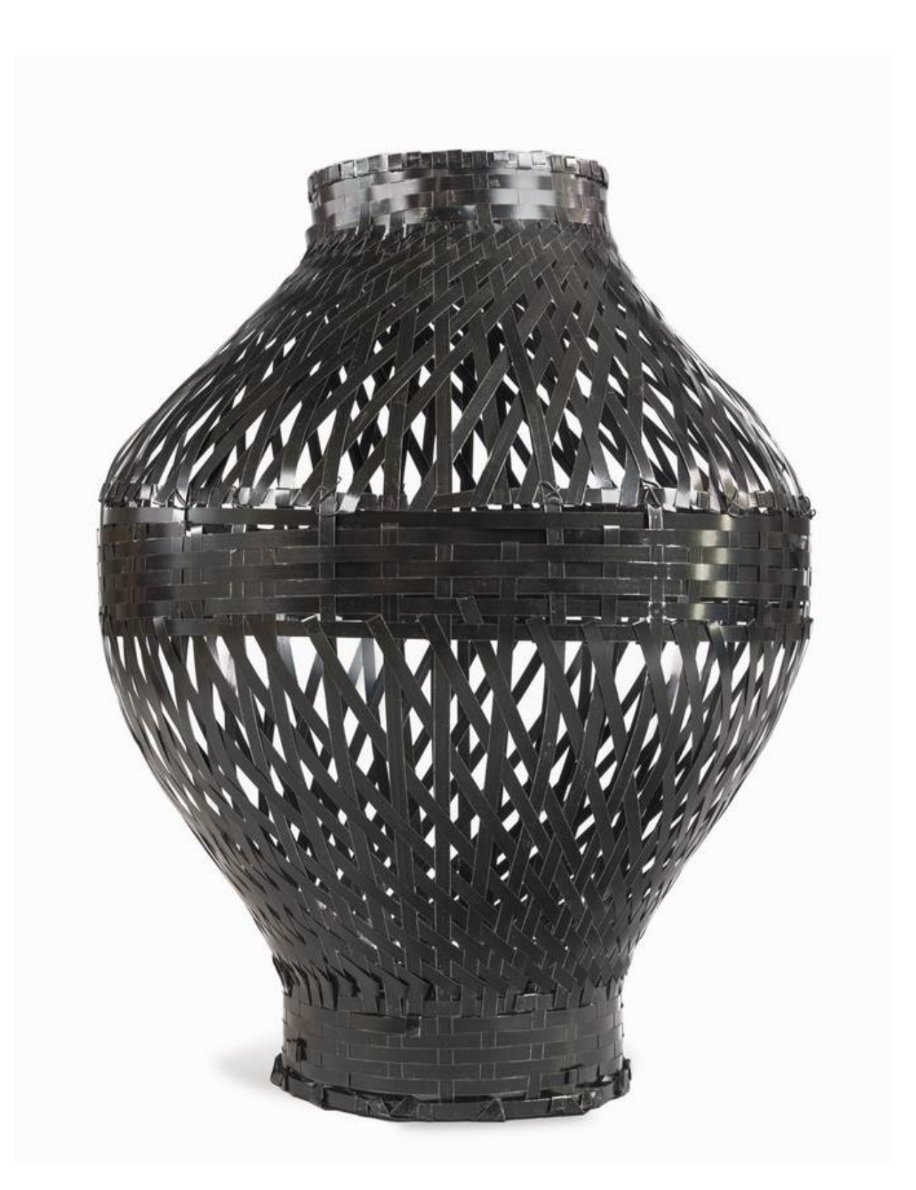
Plate 2: Vessel , 3' x 2' x 2', steel, 2021