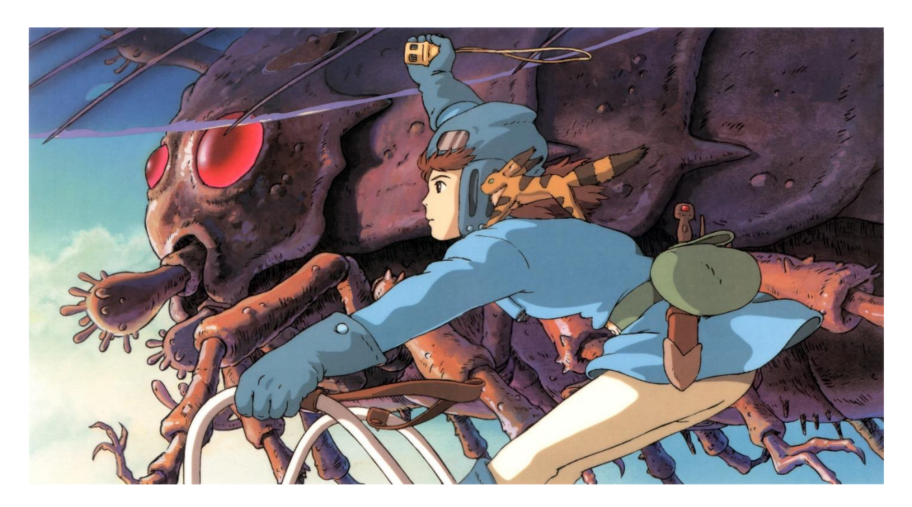
Figure 1: Scene from Hayao Miyazaki's film Kaze no Tani no Nausicaa 1984

this, as they have seemingly endless possibilities to portray symbolism. A good example of this would be Hayao Miyazaki's 1984 film Kaze no Tani no Nausicaa , also translated for western audiences as Nausicaa of the Valley of the Wind . The setting of the film takes place in a fictional dystopian world that has been desolate for a thousand years following a near extinction event brought on by massive advanced mechanical robots known as Giant Warriors. The film was inspired by the Minamata disaster which happened in 1932, where a petrochemical factory dumped heavy metals, which included mercury, into the Kyushu Bay.