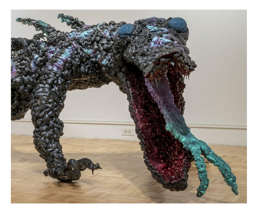
Plate 8: Gorathel (detail shot), 50" x 6' x 16', steel, mesh wire, and spray foam, 2023