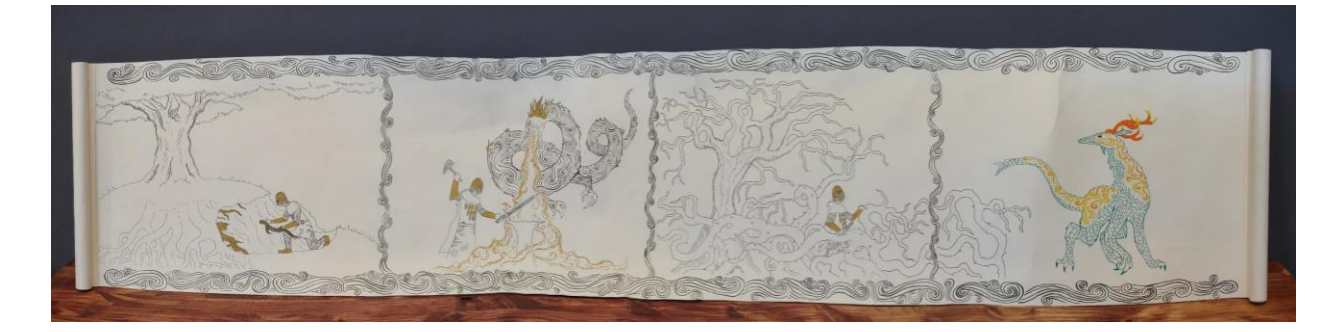
Plate 11: Legend Apotheosis 2, 11.5" x 60", ink on paper, 2023