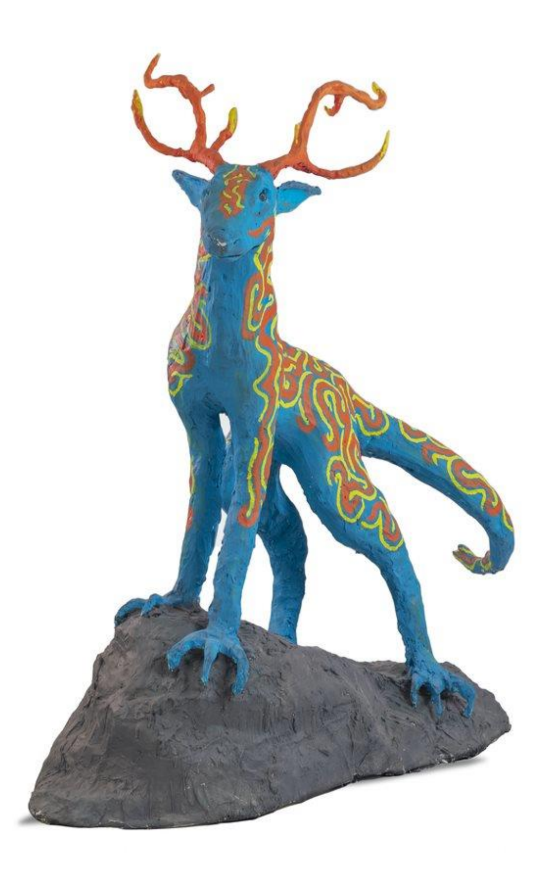
Plate 6: The Guide, 52" x 18" x 47", mesh wire and plaster gauze, 2021