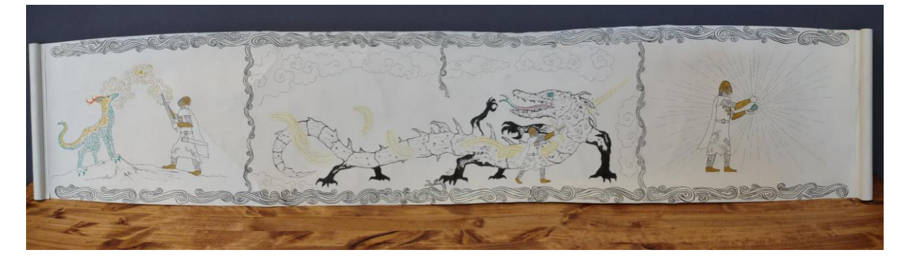
Plate 12: Legend Apotheosis 3, 11.5" x 60", ink on paper, 2023