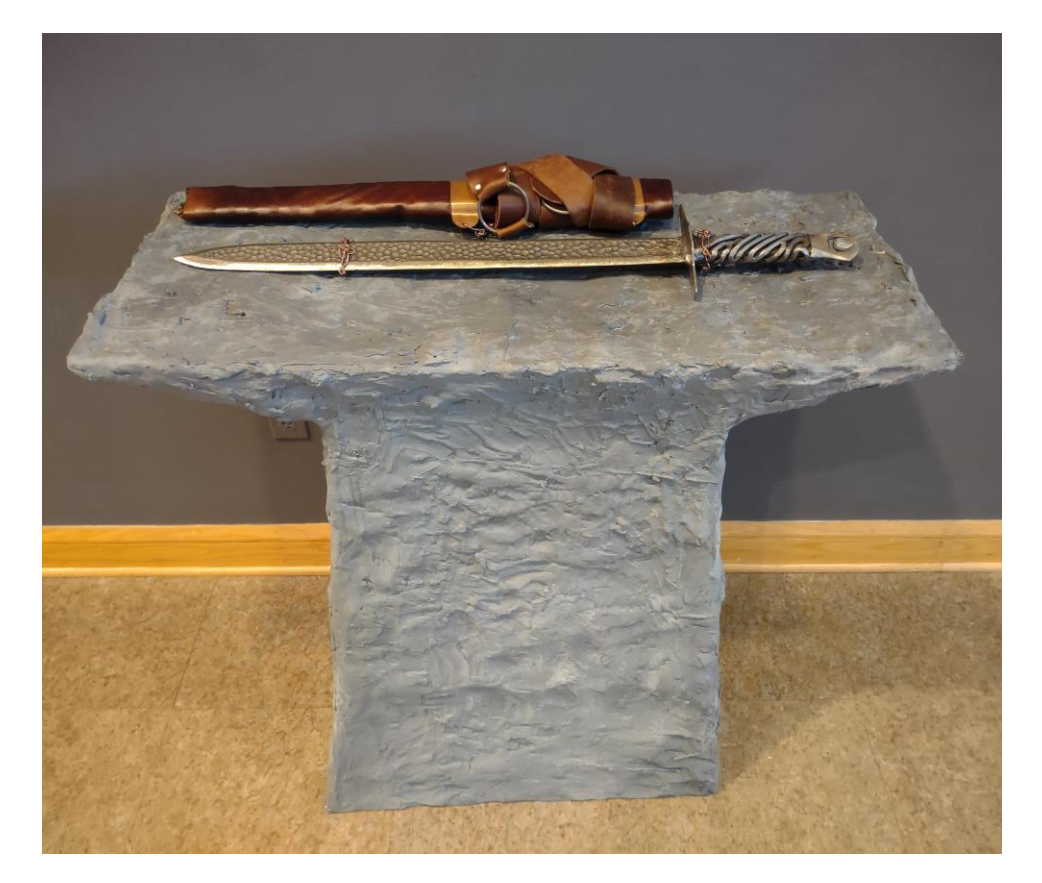
Plate 5: Sword of the Iron Root Tree (with pedestal), 40" x 36" x 15.5", iron and steel, 2023

With the unknown world open to him, Ayon is presented with a task of creating a weapon that can kill the monster, Gorathel. With the directions from the dragon mentor, Ayon is able to find the location of materials needed to craft the magical Sword of the Iron Root Tree (plate 4). The sword I made represents the first trial Ayon overcomes. It was important that the sword have a legendary aesthetic of a classical longsword. I started by carving the blade, handguard, handle, and pommel of the sword in a soft pine wood. After completing that process, I cast the blade in iron so that the material fit the narrative of the sword's namesake. I wanted Ayon's sword to capture the elements of other legendary swords, which led me to researching the history and myths of sword smithing.