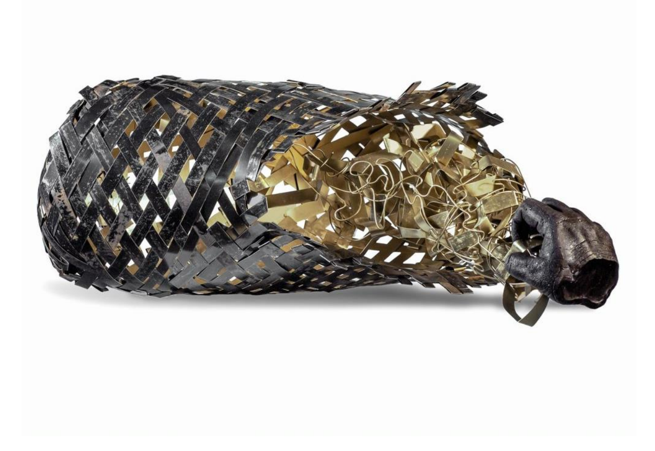
Plate 1: Thief, 9" x 23" x 24", steel and wax, 2021

The piece Thief consists of a hand representing the intrusive presence of Gorathel, ripping the amulet out of a ruptured container. The steel exterior was left in its original color of black with rusted spots collecting on the metal. This gives the structure a sense that there has been a significant passage of time since the amulet was placed within the container. The hand is also painted black to match the description of Gorathel having onyx skin. For this sculpture I made a mold of my hand in alginate and cast it in wax. With the inclusion of the hand, it creates the visual sensation of a forceful gesture. To contrast the exterior color tones, the interior was painted gold to signify great value.