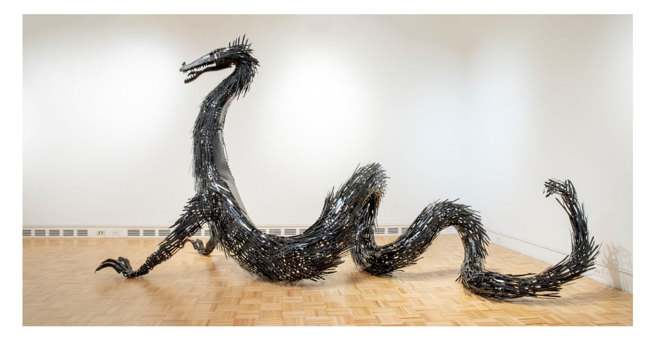
Plate 3: Dragon , 8' x 4' x 15', steel, 2022

Out of the vessel appears a massive dragon that thanks Ayon by helping him in his journey. The dragon in my myth serves the role of a mentor figure, as Ayon is struggling to find a weakness to Gorathel. When he frees the dragon, it solves the issue by providing Ayon with a new goal, to find the object that can harm Gorathel. For the piece I titled Dragon (plate 3), I made the choice to splice together common characteristics of familiar dragons. This dragon is more serpentine like in Chinese and Japanese culture, while it has two front limbs typical of the Old Norse depictions of a lindwyrm. The scales along the body of the dragon are designed to look like feathers, making the creature appear less cold blooded and reptilian. For my materials, I used round steel bars for the structure and steel banding strap for the details and skin. The process of making the individual scales to cover the body became a form of therapy for myself. The repetitive movements, the folding of the metal, and the anticipation of creating a form I was familiar with stimulated my productiveness.