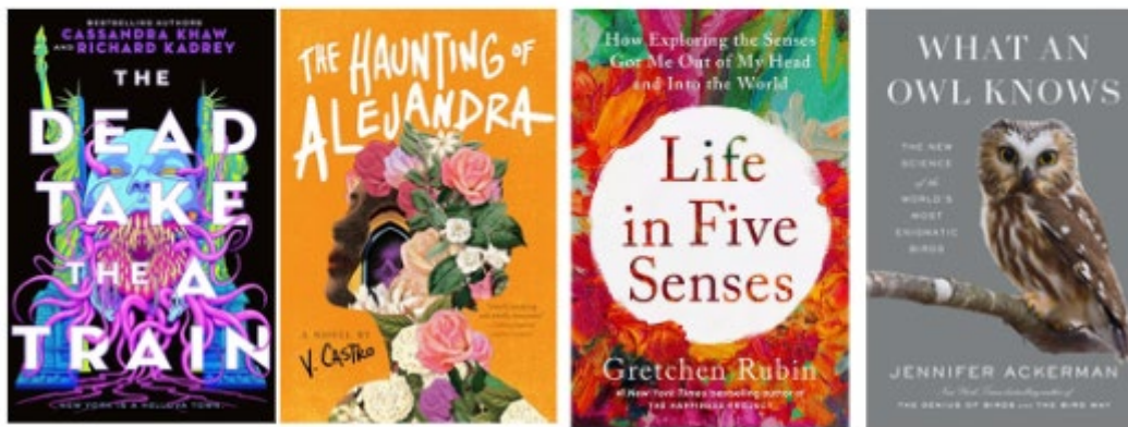
A presentation slide displaying new fiction and non-fiction titles in Joyner Library's Popular Reading collection.

Please browse titles and check out newer and trending titles on display in Gray Gallery today!