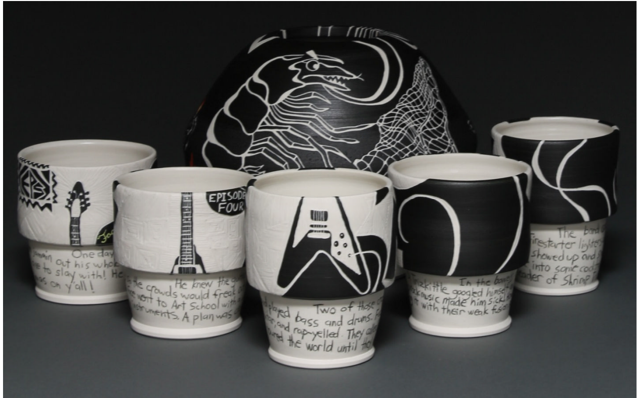
Face in Space (unstacked)