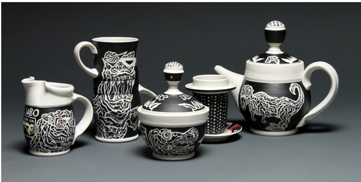
Rex Spex Tea Set, Porcelain, 2012