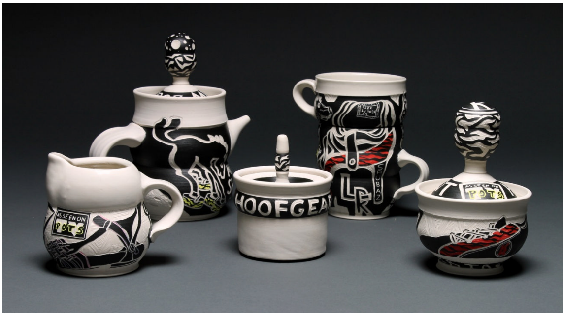
Shubaz Coffee Set, Porcelain, 2012