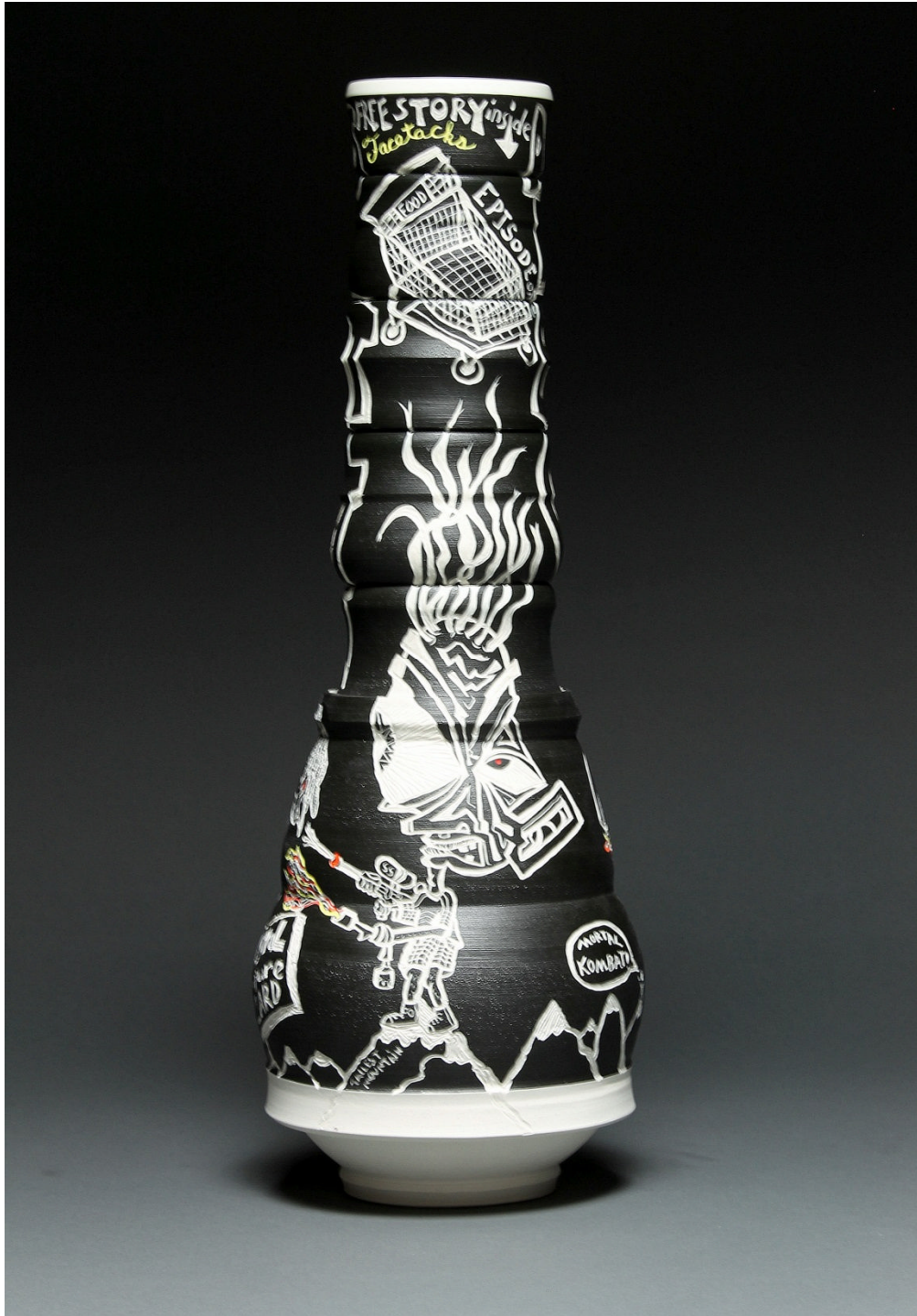
Crystal Vulture Buzzard (stacked) Porcelain, 19 inches, 2012

With Slip Soaker Coffee Set, Text of Story and Jingle