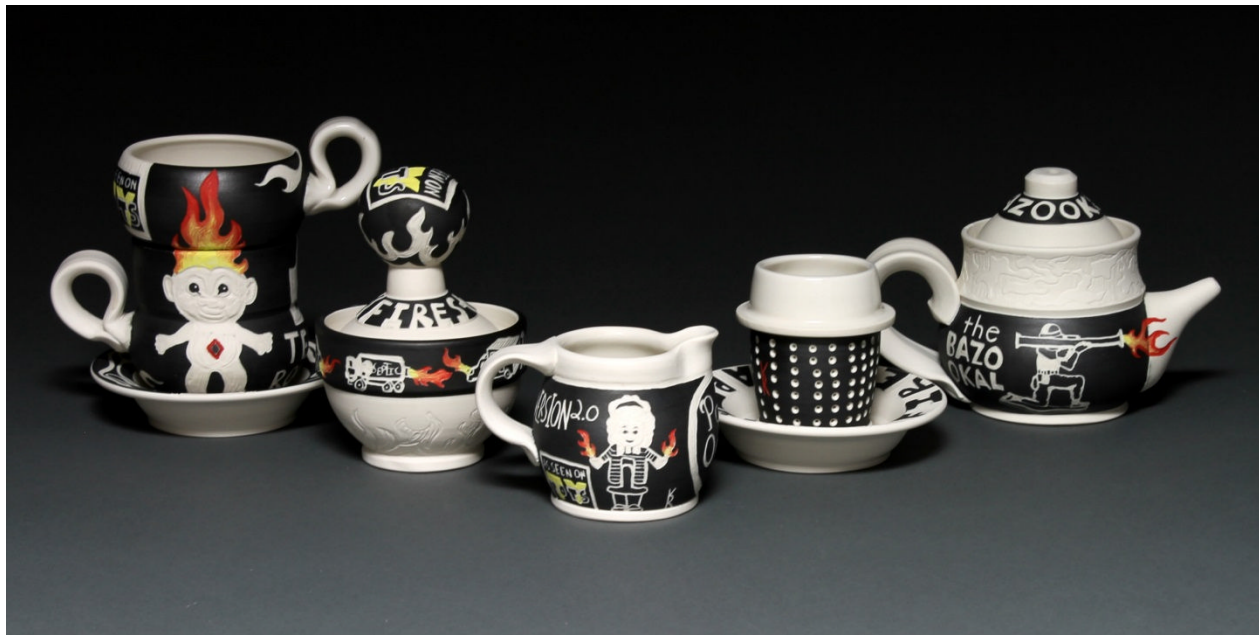
Firestarter Tea Set, Porcelain, 2013