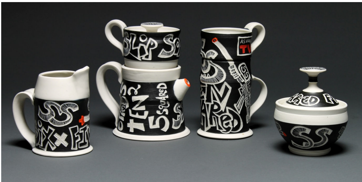
Slip Soaker Coffee Set, Porcelain, 2012