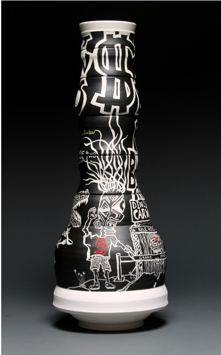
Dinosaur Car Wash (stacked) Porcelain, 20 inches, 2012

With Rex Spex Tea Set, Text of Story and Jingle