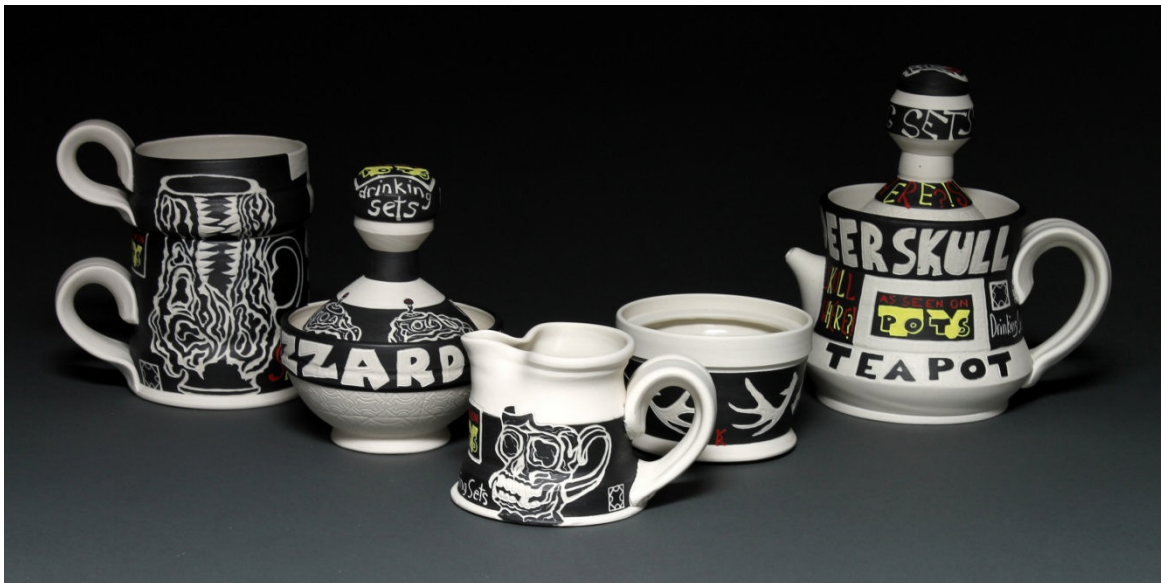
Skull Where?! Drinking Sets Coffee Set, Porcelain, 2013