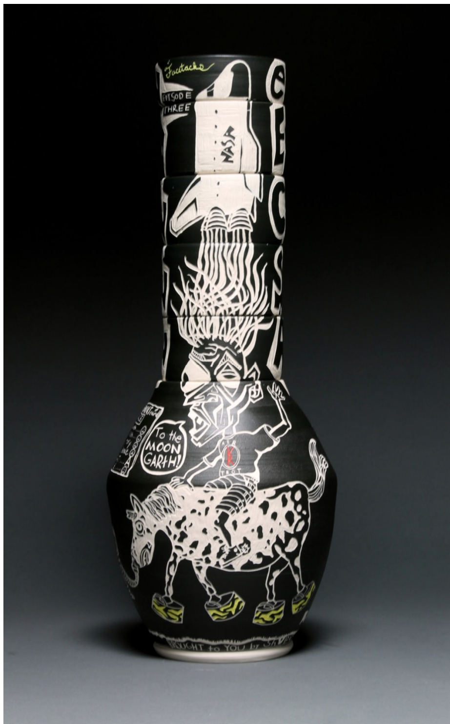
Face in Space (stacked) Porcelain, 21 inches, 2012

With Shubaz Coffee Set, Text of Story and Jingle