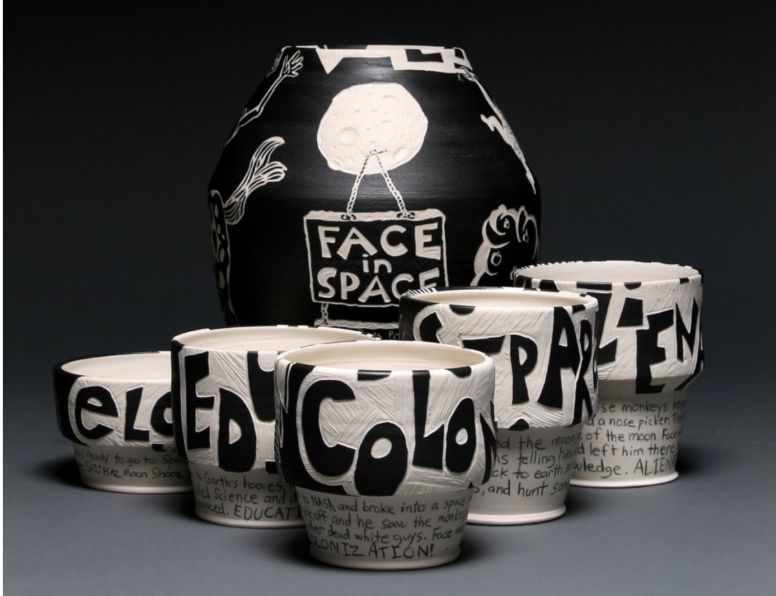
Face in Space (unstacked)