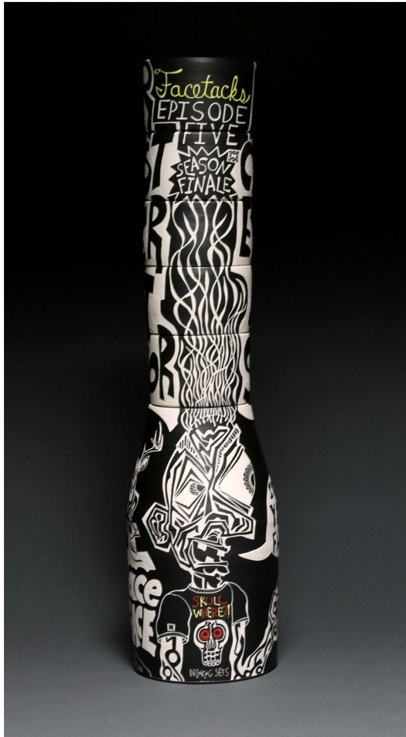
I face Face , (stacked) Porcelain, 23 inches, 2013

With Skull Where?! Drinking Sets Coffee Set, Text of Story and Jingle