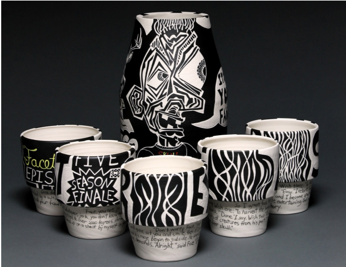
I face Face (unstacked)