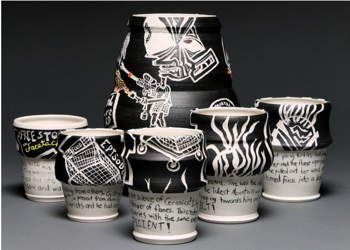
Crystal Vulture Buzzard (unstacked)