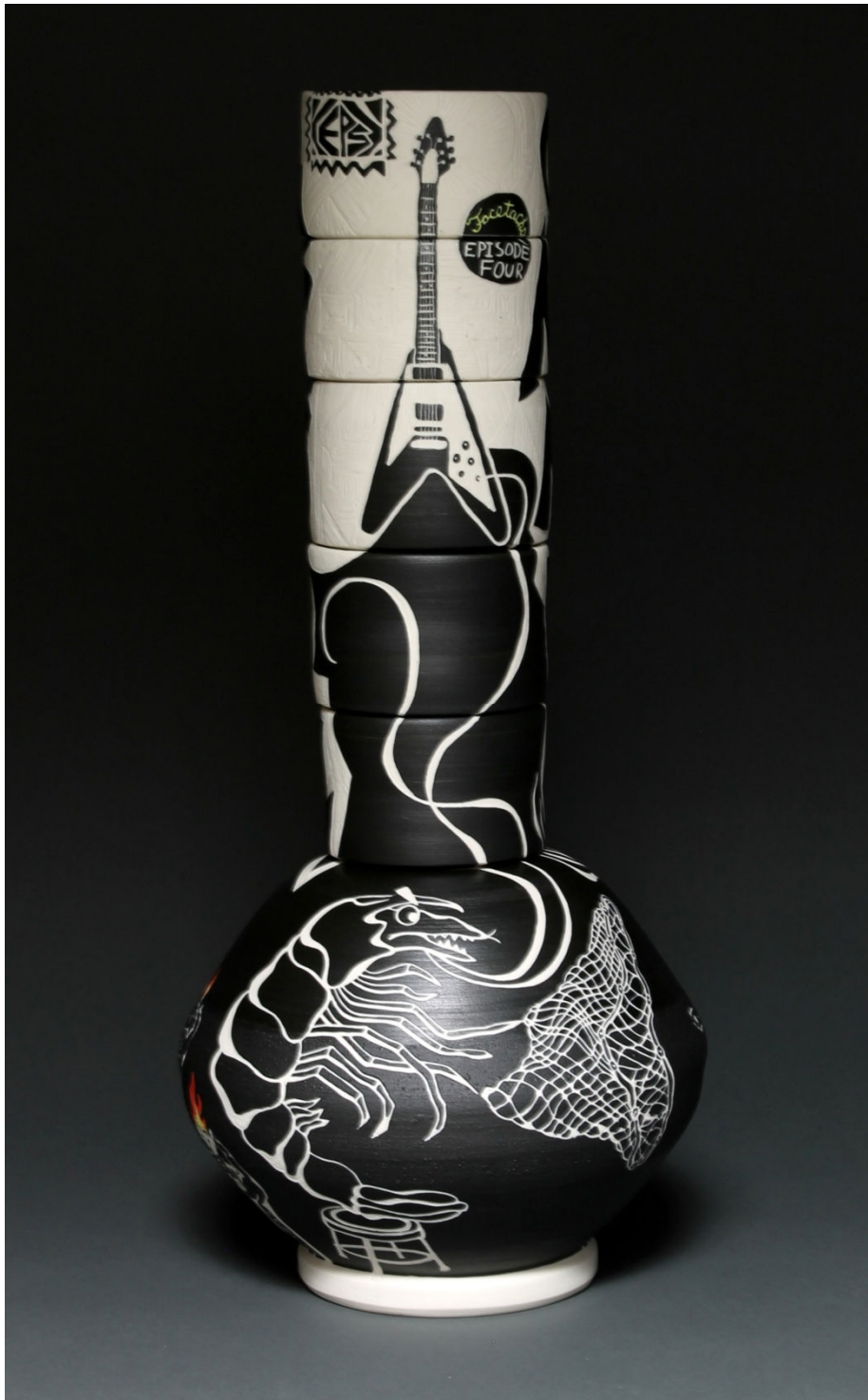
Shrimp Trizkit (stacked) Porcelain, 19 inches, 2013

With Firestarter Tea Set, Text of Story and Jingle