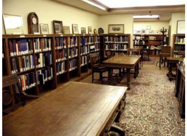
The reading room of the Friends Historical Collection

Hege Library began in 1908 with a matching grant from Andrew Carnegie, and has grown to encompass about 80,000 square feet of space. Contained within the library are some 250,000