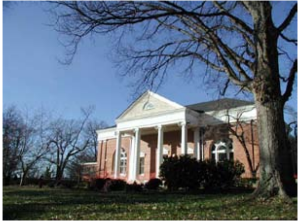
Exterior view of Hege Library on the campus of Guilford College.

wounded from both armies, and burying the dead in New Garden Meeting's cemetery. True to Quaker principles, the campus was a stop on the Underground Railroad before the Civil War, and home to a resistance movement against Confederate conscription during the War.<sup>10</sup> Now home to roughly 2,600 students, Guilford College remains committed to its Quaker roots of wisdom and virtue—contemplation and action—on a campus dedicated to high quality liberal arts education informed by the values of "honesty, compassion, integrity, courage and respect for the individual."11 What was once "majestic wilderness" has been incorporated into the city of Greensboro, but Guilford College retains its greenery and its sense of quiet: the United States Department of the Interior has recognized the campus as a National Historic District. Guilford College is one of 15 undergraduate Quaker colleges in the United States, and the only one in the South.