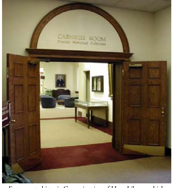
Entrance to historic Carnegie wing of Hege Library which includes the Friends Historical Collection..