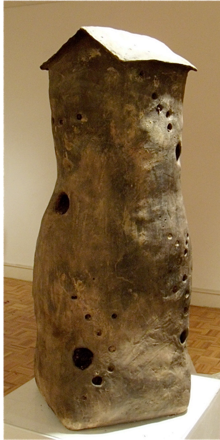
Figure Dark Barn Vessel Resiliency Strength

This piece was built with thin coils. It has a slight figurative shape, representing the barns that seem to have personalities, like the people who built them. This piece has a series of vertical holes that serve as openings for growth. The vessel was pit fired in sawdust to achieve a dark varied patina.