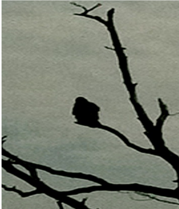
Figure S2. Danny's Photo-Elicitation Image: "Empowerment"

Figure S2. Danny shared a photograph he took of an “eagle poised on a tree, ready to perform his duties in life, with care and introspection over what he’s doing.” The eagle, which he described as self-aware, represented the “strength and power” and “looking inward to doing outward.” found in the IHC approach.