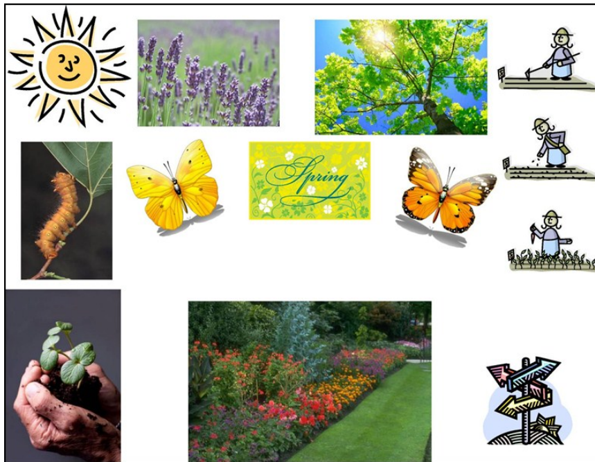
Figure S7. Ericka's Photo-Elicitation Image: "Metamorphosis"

Figure S7. Ericka's collage depicts the integration of the key elements of IM and health coaching in a seamless system that operates as a unit to support client "metamorphosis." Mindfulness is the dirt, the soil that the garden grows in, that nurtures our choices. The caterpillar and the butterflies represent the transformation to a new person, a happier person. Change. That was a big part. Working the dirt is the process, the effort that's involved. And, the flowers and the trees and the garden, that's peacefulness, it's a safe place, and the sun is the energy for growth...The one-to-one coaching just intensified the support and the process, and the coaches showed that they cared.