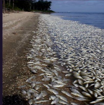
Neuse River Foundation 2009