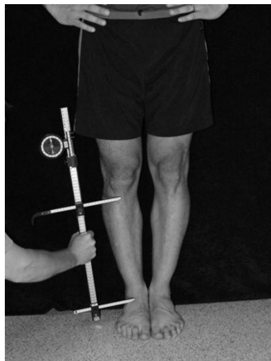
Figure 1: Measurement of the Tibial Mechanical Axis.