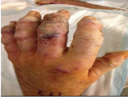
FIGURE 1: Inflammatory nodules on the left hand on second admission.