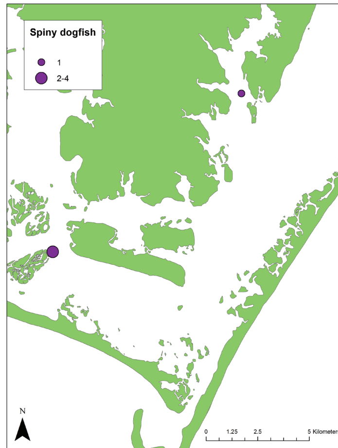
Figure 2. Capture locations of spiny dogfish in gillnet sets within Back Sound and lower Core Sound in May 2014.

Stehlik, 2007). Within this area, spiny dogfish were captured primarily in the 5–17°C temperature range (Sagarese et al. , 2014). Spiny dogfish occurred at temperatures up to 20°C in Massachusetts inshore waters in autumn, but were most abundant within the 6–15°C range (Stehlik, 2007). Acoustically-tagged spiny dogfish were only detected near the Hatteras Bight between mid-December and early April, with the majority of detections occurring in February and March, and appeared to make inshore-offshore movements in search of cooler temperatures (Rulifson et al. , 2012).