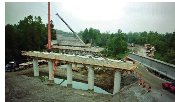
Fig. 5. Drone helps conduct site inspection of the arterial road construction.

In addition to inspection, safety monitoring, surveying and transportation, more than a dozen other uses were suggested, including security monitoring, defense against claims, and use in education to observe construction methods via virtual field trips.