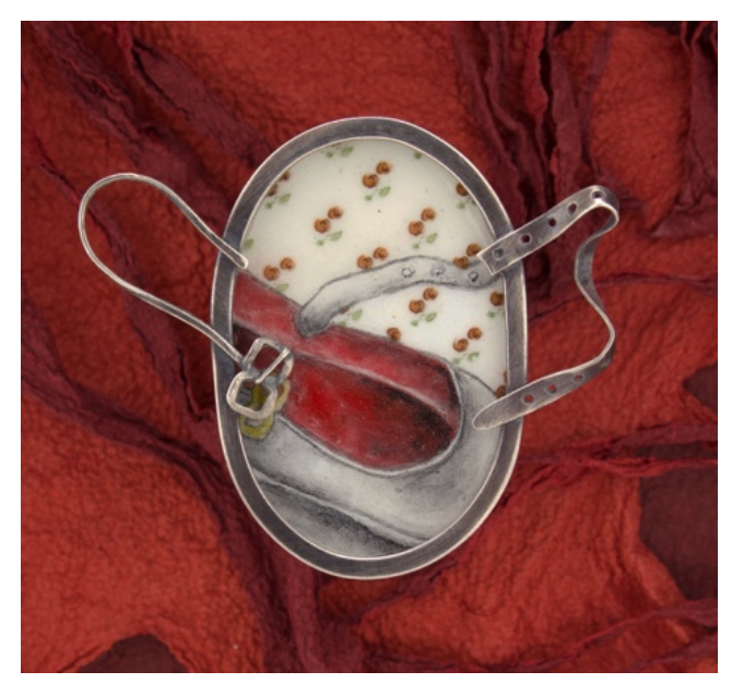
Figure 14. Lost Innocence (Fallen Shoe) , 3" x 3", Enameled steel, underglaze pencil, overglaze paint, vintage ceramic decals.

An inspiration for these two pieces and the concept of the exhibit is the work of contemporary American artist Natalie Gwen Frank (1980 -). She is predominantly a painter whose large figurative paintings deal with sex, gender and power ("Natalie Frank"). In 2015