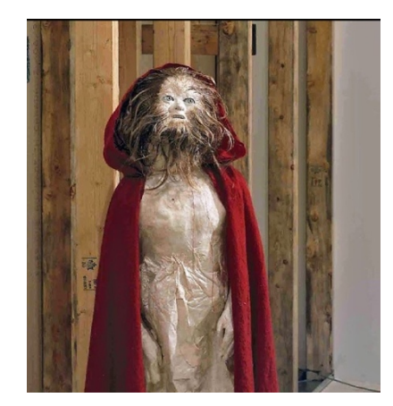
Figure 26. Smith, Kiki, Daughter , 1999. Millington, Ruth. "Artists in Focus/ 7 Contemporary Artists Disturbing the Dark Side of Fairy Tales." Ruth Millington , 6 July 2018, ruthmillington.co.uk/.

(see Fig. 26). The girl may be the daughter of Little Red Riding Hood and the wolf as she appears to be transforming into a werewolf with the placement of hair on her face (Palma). An accompanying soundtrack of growls completes the transformation. In all of these works Smith represents Little Red Riding Hood not as a victim but as an equal partner to the wolf or as an emerging figure that has grown from the relationship.