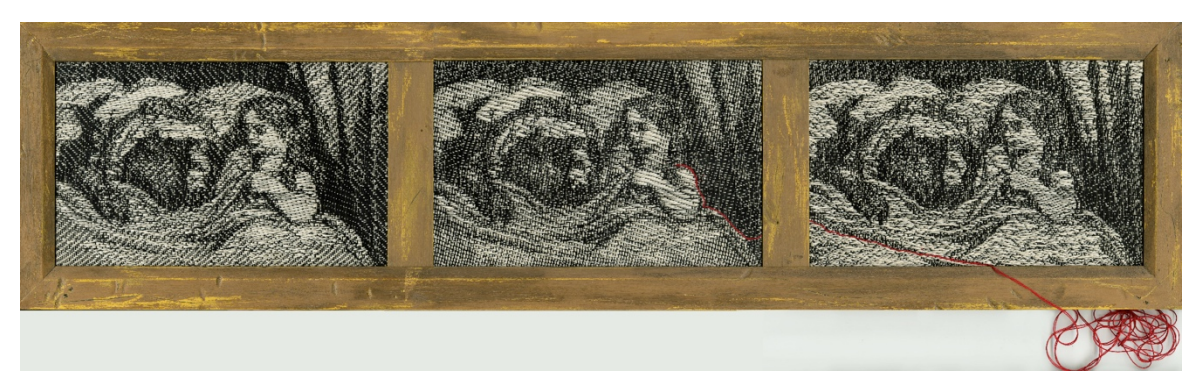
Figure 23. In Bed with the Wolf (Views of Gustave Doré's 1883 woodcut), 11" x 45", Cotton thread, handmade distressed pine wood frame.

weaving structures were selected giving three different perspectives to the woodcut, similar to three different views of a story. The Photoshop file is interfaced with a TC-2 computerized weaving loom that selects which black, vertical warp threads need to be raised as the weaver throws by hand the white, horizontal weft threads (see Fig. 24). I made the weaving's custom frame, antiquing it to place the modern digital weaving into the Grimm brothers' time period. An embroidered red thread hugs the outline of the granddaughter in one of the views and then trails