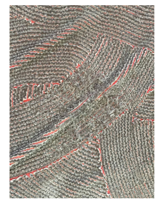
Figure 28. Coming into Being (Detail of linen chenille).

Being (see Fig. 27) is presented. Little Red Riding Hood is not a victim of sexual predation or a helpless, disobedient spoilt child, but has grown with a wolf's characteristics including strength and independence. The piece is a red hooded cape like the one Little Red Riding Hood wears, but it is made with four layers of linen. The inner layer is hand-dyed red showing passion and power peeking through the wolf-like outer colors of tan, gray and charcoal. The four layers have been made into chenille by sewing parallel lines