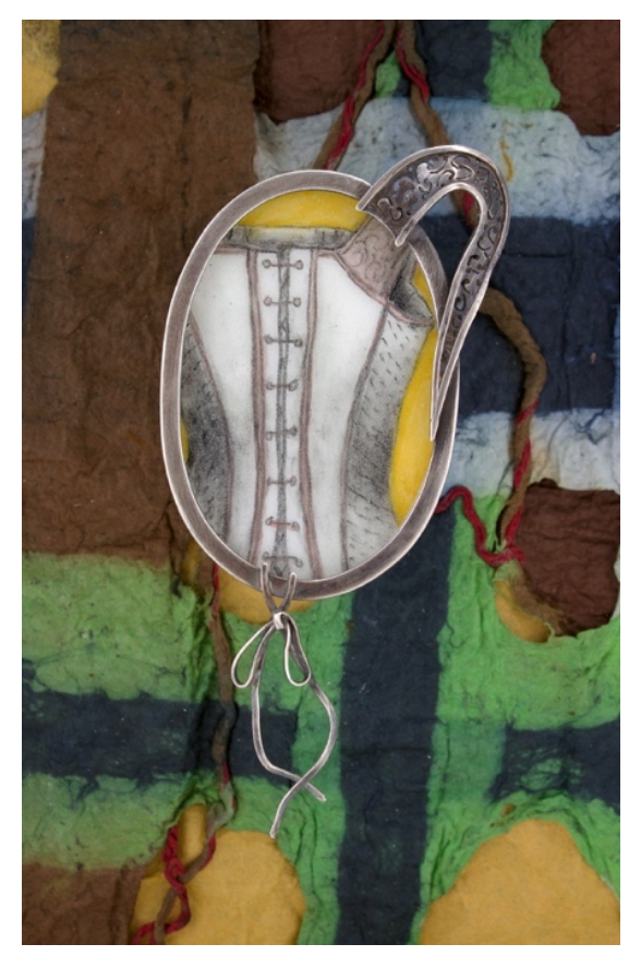
Figure 12. Hidden Constraint , 2" x 3.5", Enameled steel, underglaze pencil, overglaze paint, sterling silver.

view of a laced-up corset. Corsets throughout history were used to shape the female body to