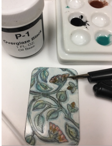
Figure 8. Enamel process of drawing and painting: (1) Underglaze pencil drawing; (2) Painting with overglaze; (3) Overglaze black (P-1) used with a nib dip pen.