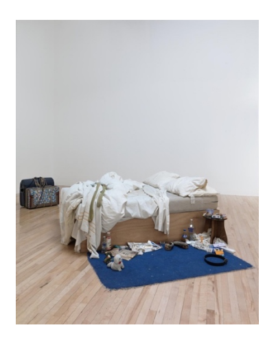
Figure 17. Tracey Emin, My Bed , 1998. Tate. "Tracey Emin Born 1963." Tate , www.tate.org.uk/art/artists/tracey-emin-2590.

Prominent in the exhibit is The Scene of the Crime (see Fig. 16), an installation that is meant to evoke the violence that occurred in grandma's cottage. The British artist Tracey Emin (1963 -) and her piece My Bed (1998) (see Fig. 17) is one inspiration for this portion of the exhibit. Emin's piece displays the actual bed in which she slept in for four days when she was dealing with severe depression (Tate Shots). The sheets are disheveled and the bed is surrounded by empty alcohol bottles, cigarette butts, bloodied panties, used condoms, slippers and