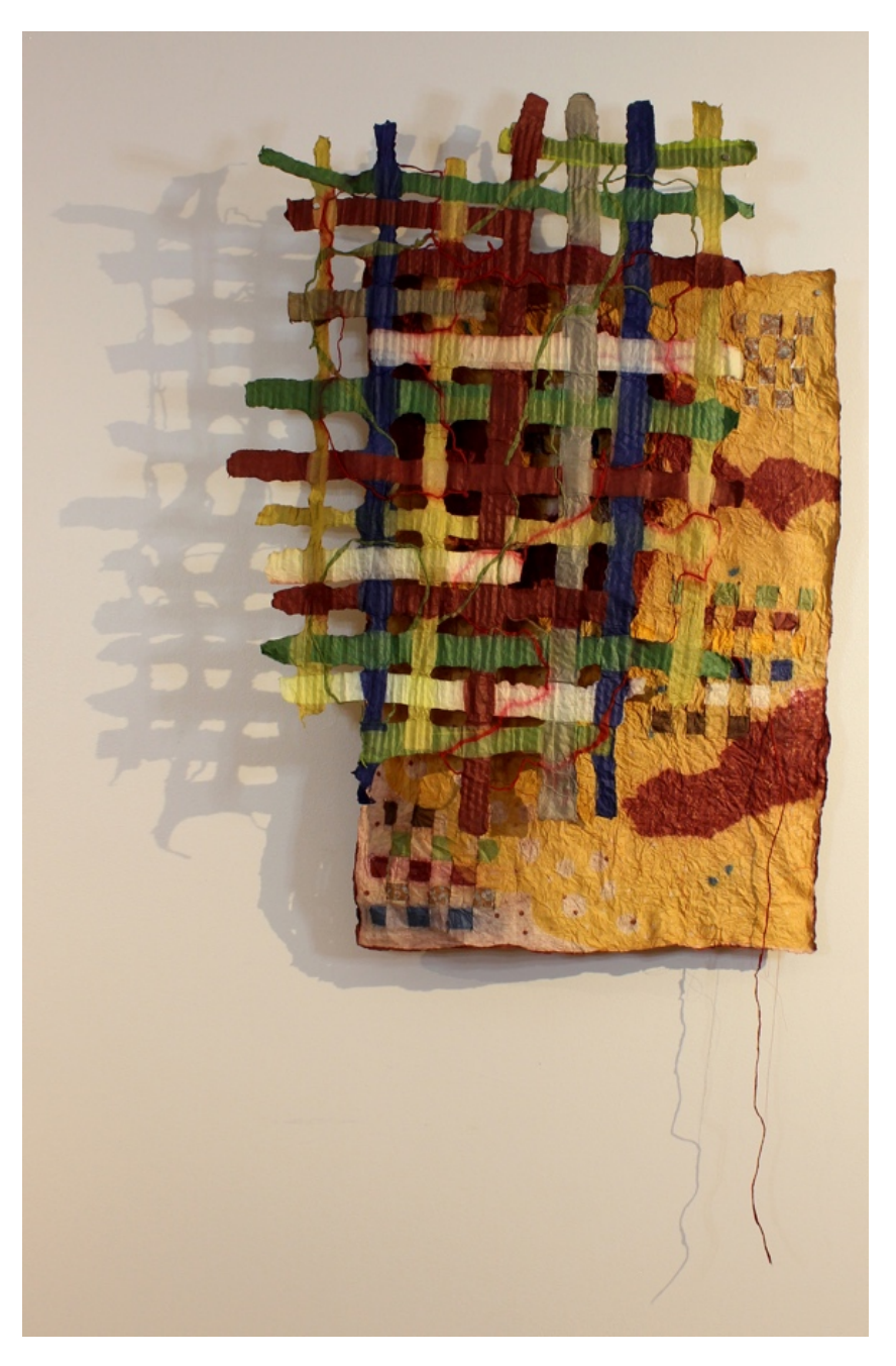
Figure 11. Rigid Obedience, 28" x 42", Hanji mulberry paper, cotton thread.