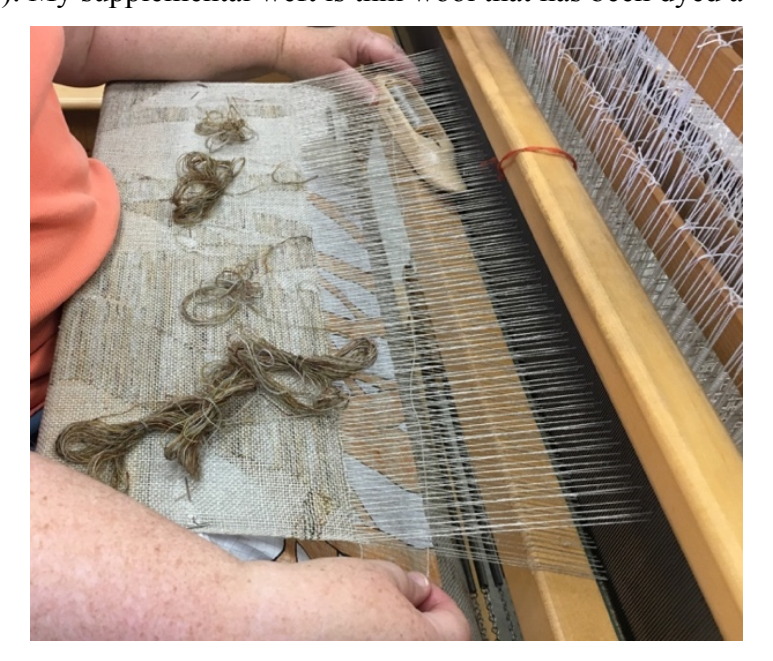
Figure 2. Weaving transparency with cartoon under warp threads.

variegated brown to simulate tree bark. Linen and wool were more common than cotton during the time frame of the story's oral tradition. Suspending the transparency weavings away from the walls by the entrance adds the appearance of depth to the woven trees. A single bright red thread embroidered along one tree line on an inner edge