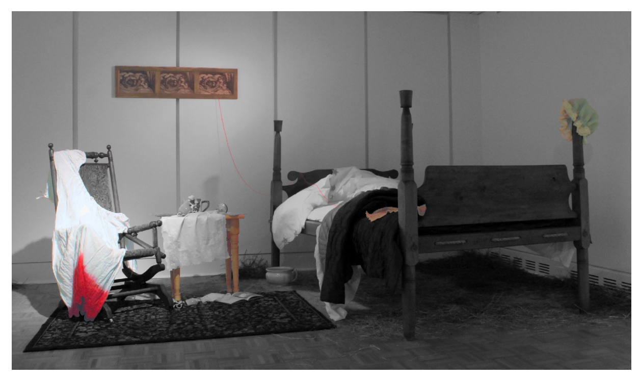
Figure 19. The Scene of the Crime (B&W with hand-made items in color: Linen chemise, Maple end table, Digital weaving with antiqued frame, Crocheted bed throw, Grandma's nightcap).

Grandma's iconic nightcap hangs from one of the bedposts. I sewed the nightcap using hand-woven linen patterned fabric. Tossed on the bed's comforter is a crocheted throw titled Grimm Encounter (see Fig. 20). The technique, filet crochet, allows one to crochet a picture and words into a piece. The scene depicted shows opposing profiles, with a woman's outline facing outward