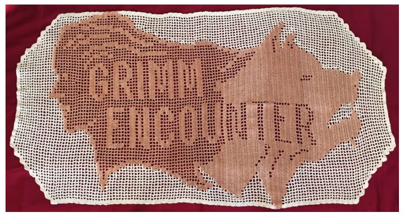
Figure 20. Grimm Encounter, 24" x 60", Hand-dyed cotton crochet thread.

Grandma's iconic nightcap hangs from one of the bedposts. I sewed the nightcap using hand-woven linen patterned fabric. Tossed on the bed's comforter is a crocheted throw titled Grimm Encounter (see Fig. 20). The technique, filet crochet, allows one to crochet a picture and words into a piece. The scene depicted shows opposing profiles, with a woman's outline facing outward