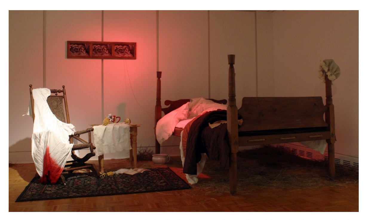
Figure 16. The Scene of the Crime , 10' x 8', Artist handmade objects: Handwoven linen nightcap, hand-sewn and hand-dyed linen chemise, digital weaving in handmade and antiqued frame, crocheted bed throw. Found objects: Antique rope bed, antique rocker, wool rug, vintage family linens and quilt, chamber pot, Little Red Riding Hood teapot, tea cups, candlestick and beeswax candle, Little Red Riding Hood books from 1920s and 1930s.

Prominent in the exhibit is The Scene of the Crime (see Fig. 16), an installation that is meant to evoke the violence that occurred in grandma's cottage. The British artist Tracey Emin (1963 -) and her piece My Bed (1998) (see Fig. 17) is one inspiration for this portion of the exhibit. Emin's piece displays the actual bed in which she slept in for four days when she was dealing with severe depression (Tate Shots). The sheets are disheveled and the bed is surrounded by empty alcohol bottles, cigarette butts, bloodied panties, used condoms, slippers and