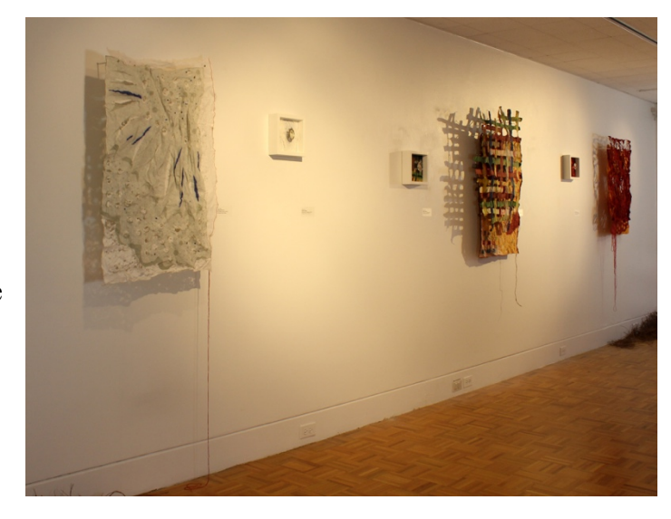
Figure 6: Gallery left wall with Tempting Innocence, Insidious Danger, Hidden Constraint, Rigid Obedience, Lost Innocence (Fallen Shoe) and Aftermath.

hanging and a wearable enamel piece (see Fig. 6). Each pair explores a separate theme from the early literary Little Red Riding Hood stories: innocence, obedience and violence. The two works within a pair express the same theme but the contrast in size and materials between the wall hanging and enamel convey distinct perspectives and engage the viewer differently.