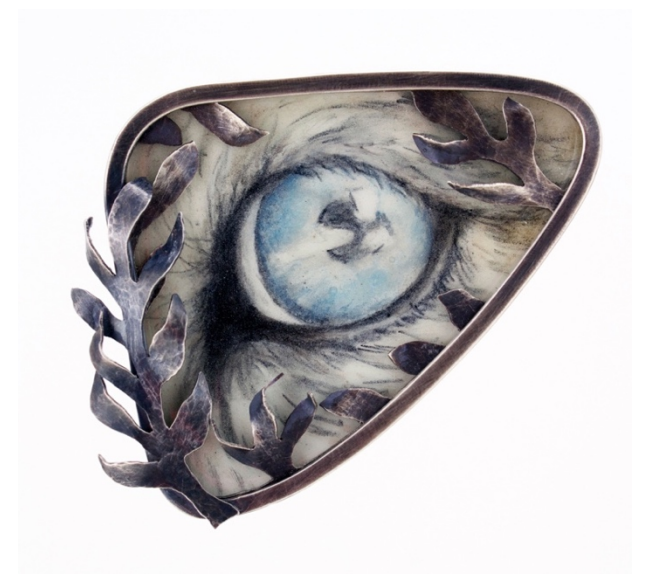
Figure 30. My Wolf's Eye , 4" x 3.5", Enameled steel, underglaze pencil, overglaze paint, sterling silver.

Besides the fur, wolf features are added by the enamel brooch that closes the hood. My Wolf's Eye shows a close-up of a wolf's eye peering through sterling silver leaves (see Fig. 30). It is in the style of the other exhibition brooches, thereby giving a nod to previous narratives of Little Red Riding Hood. The final two weaving transparencies of the woods, Little Red Riding Hood: