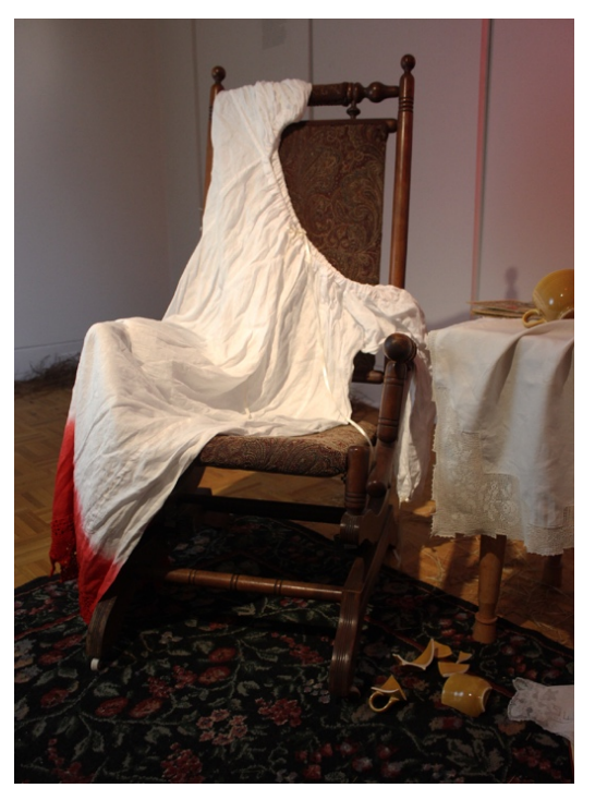
Figure 22. Stained with Blood (Displayed in The Scene of the Crime ), 30" x 48", Hand-dyed linen with handmade crocheted edging, cotton crochet thread, ribbon.

Hanging on the back wall is the framed digital