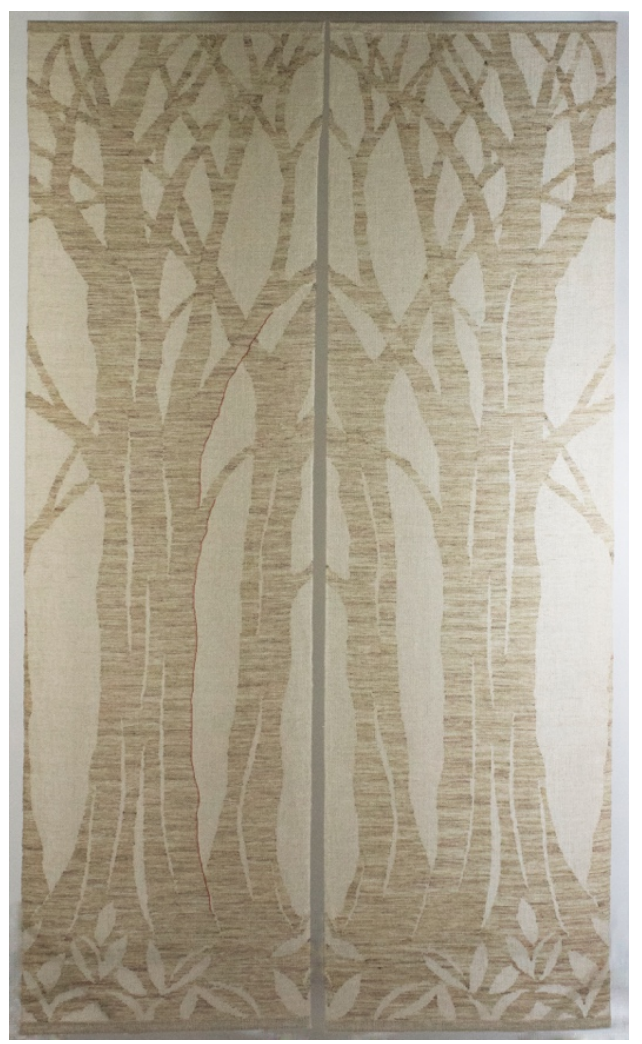
Figure 1. Little Red Riding Hood: The Beginning , 48" x 84", Handwoven linen and hand-dyed wool, embroidery cotton thread.

Installation art "refers to a dedicated space in which one artistic vision or aura is at work ... [in which] the artist has created an arrangement that is an integrated, cohesive, carefully contrived whole" (Rosenthal 26). Though the cave paintings at Lascaux, France could be considered an installation (Rosenthal 23), modern installation art is a relatively new genre beginning in the 1920's with experimentation by Dadaists, Russian constructivists and the De