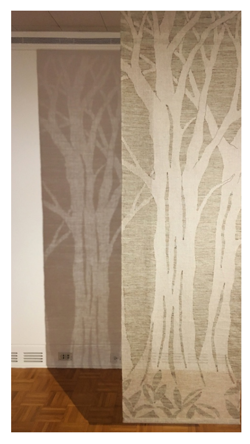
Figure 5. Shadow on gallery wall from Little Red Riding Hood: Arrival .

benign clean gallery space into an ominous darkened wood. Besides the set of transparency weavings at the entrance of the exhibit which establishes the forest scene, another set Little Red Riding Hood: Arrival (see Fig. 4) hangs within the gallery space. The theme of contrasts and opposites runs through the exhibit, complementing the contrast between the girl protagonist and the wolf. As such, the second set of weavings are the reverse value of the entrance set of weavings, with the denser areas being the background and the trees being the transparent areas. The weaving technique is the same. To signify the lushness of the forest and the growth of the main character, the variegated brown