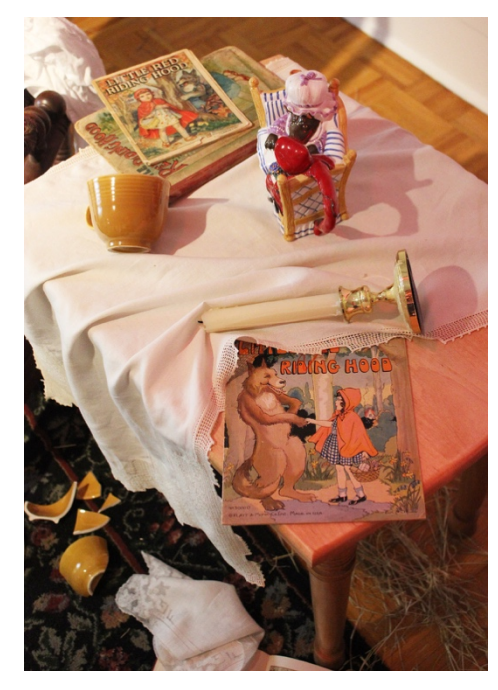
Figure 21. The Scene of the Crime (Detail) Handmade maple end table with found objects including Little Red Riding Hood teapot, Little Red Riding Hood books from 1920s and 1930s and broken teacup.

disordered with a candlestick knocked down and a tea cup broken on the floor along with a scattered handkerchief and an opened book of Little Red Riding Hood from 1934 showing the wolf in disguise waiting for his next victim in Grandma's bed (see Fig. 21). I constructed the end table in solid maple, mimicking the unique posts of the rope bed in the turned legs. A handsewn linen chemise is flung on the rocker, another clue in the crime scene. It has been dyed red on the bottom edge, illustrating its title Stained with Blood (see Fig. 22).