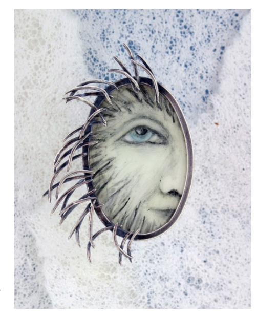
Figure 10: Insidious Danger , 2" x 3", Enameled steel, underglaze pencil, overglaze paint, sterling silver.

Innocence relates to the sexual tension of the edge of a petticoat being seen peeking out from clothing. The petticoat may be too enticing to men, making a woman culpable of instigating a sexual assault. As Zipes discusses the viewpoint of women and men in Perrault's story and accompanying illustrations, "... women want men to rape them; men are powerful but weak beasts who cannot help themselves when tempted by alluring female creatures" (Zipes, Trials 358). The embroidered red line along the lace edge again brings