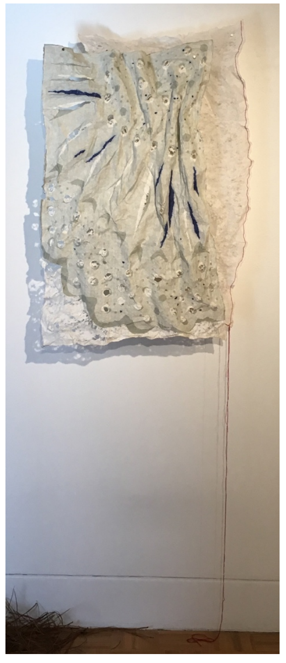
Figure 9: Tempting Innocence , 26" x 36", Hanji mulberry paper, embroidery cotton thread.

cottage, she willingly unclothes and gets into bed with him. Her fate is sealed and she is devoured. In Perrault's moral tale, she doesn't use her wiles to escape and there is no one to rescue her. Perrault makes his point clear with a final verse, explicitly warning girls of wolves, not as ferocious animals or as werewolves, but as handsome "cajoling sweet-talkers who follow