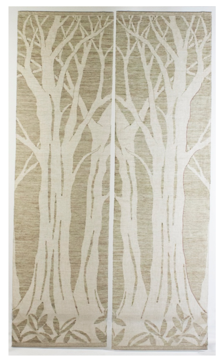
Figure 4. Little Red Riding Hood: Arrival, 24" x 84", Handwoven linen and hand-dyed wool, embroidery cotton thread.

Elements in the oral tradition that relate to the later literary tales include a girl traveling through the woods to visit her grandmother and encountering a wolf, the wolf eating the grandmother and disguising himself before the girl arrives and a second encounter between the