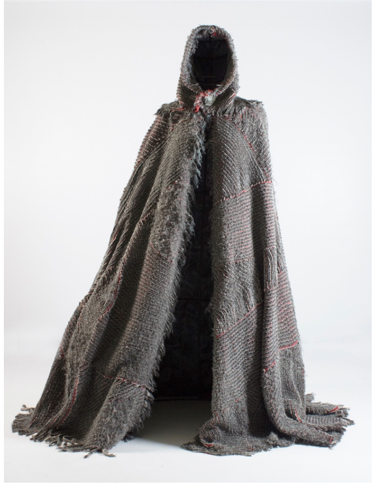
Figure 27. Coming into Being , 50" x 50" x 65", Linen (hand-dyed, handmade into chenille), screen printed & hand-dyed silk charmeuse, cotton crochet thread.

Present Kiki Smith"). Two of her works from 2001 are 6′ x 7′ drawings titled Lying with the Wolf (see Fig. 25) and Wearing the Skin. They depict peaceful scenes of a naked girl and a wolf lying in bed. The similarly large drawing Born shows grandma and Little Red Riding Hood stepping out of the wolf's cut abdomen. Smith started using Little Red Riding Hood as a motif in 1999 when she created her child-size mixed media sculpture Daughter with paper, cloth and hair