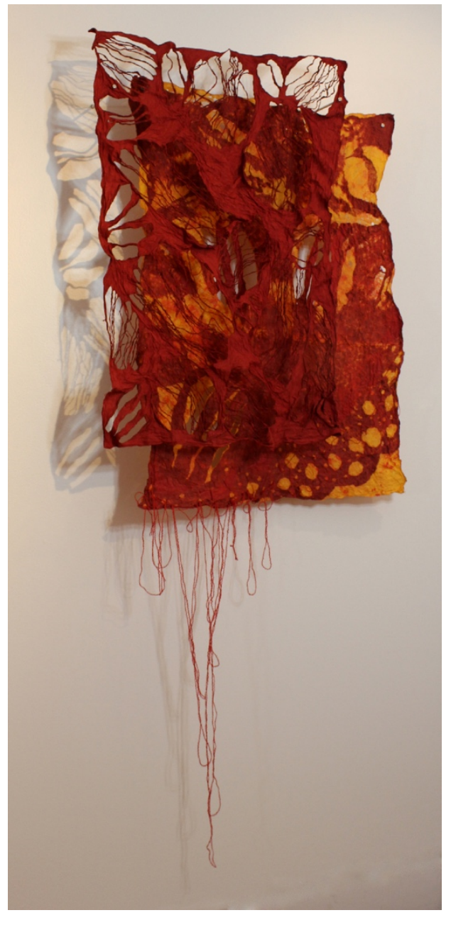
Figure 13. Aftermath , 28" x 50", Hanji mulberry paper, cotton thread and yarn.

In both Perrault's and the Grimm brothers' stories, there is a great deal of violence when the wolf devours and kills the grandmother and granddaughter. There is no mention of the