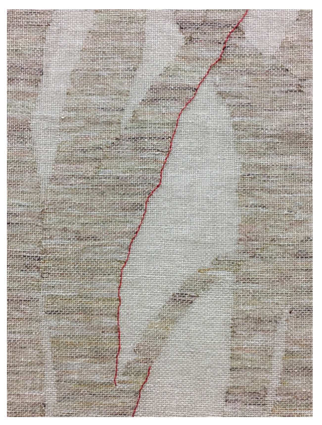
Figure 3. Little Red Riding Hood: The Beginning (Detail).

represents Little Red Riding Hood entering the woods, like the visitor, and the beginning of the story (see Fig. 3). Pine straw is strewn in the installation's corners to change the room into a forest scene. The woods are an important element to the tale, the setting for the protagonist's journey.