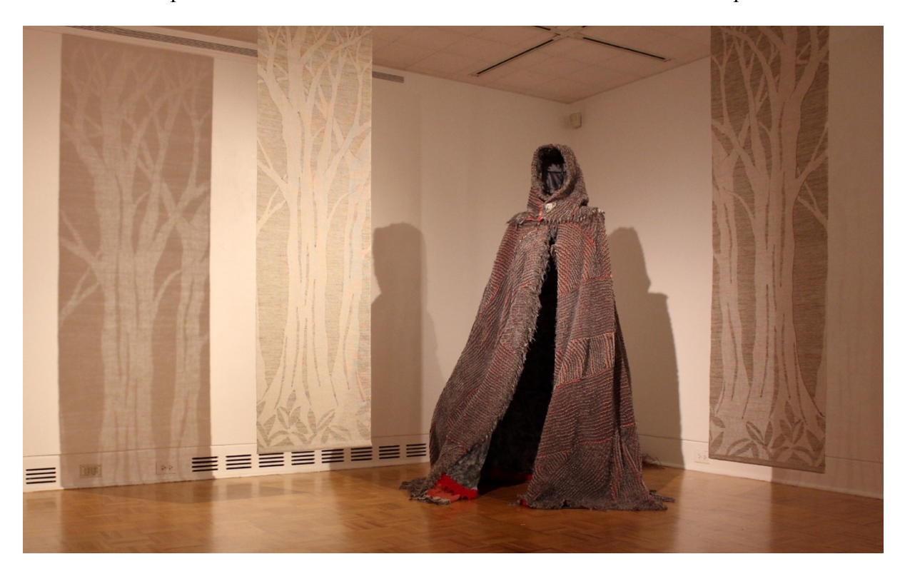
Figure 31. Coming into Being flanked by Little Red Riding Hood: Arrival.

Arrival, flank the cape placing it at the conclusion of the folk tale (see Fig. 31). Little Red Riding Hood's metamorphosis into a creature with human and wolf tendencies is complete.