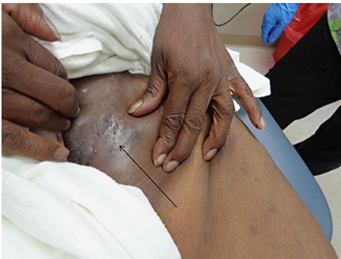
Fig. 2. HS of the left groin.