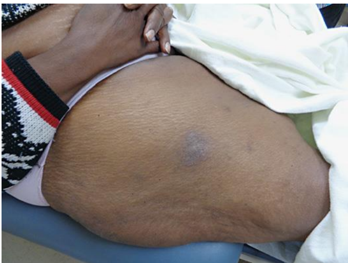
Fig. 4. Psoriasiform skin lesion at the adalimumab injection site.