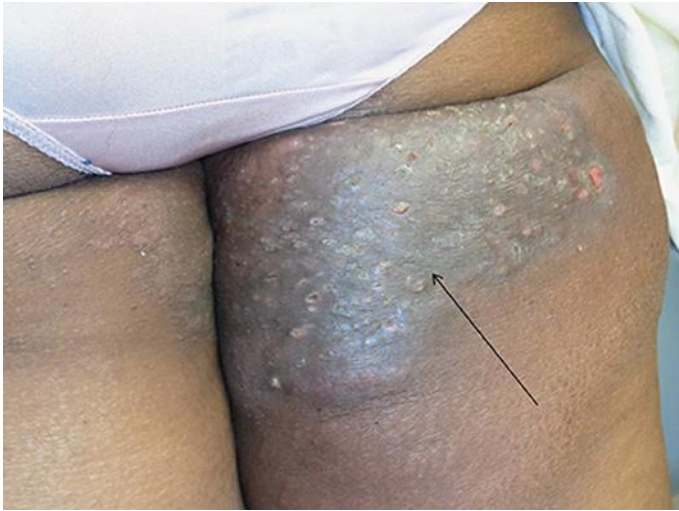
Fig. 1. HS of the posterior thigh.