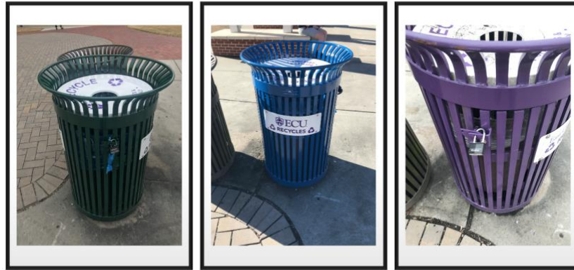
Figure 3: The green, blue, and purple bins used in the recycling audit experiment.