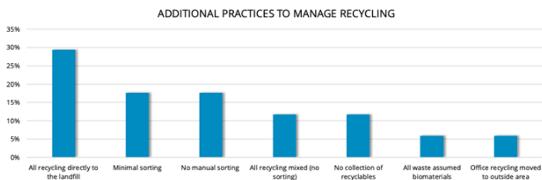
Figure 4: Common protocol changes made by waste industries after the pandemic. [2]

research, we discovered an unfortunate truth. Since stricter protocol had to be implemented for recycling management, most of these recycling efforts did not seem to pay off. The most popular protocol change being made, and probably the worst, was for all recycling to be sent directly to the landfill. Nearly 30% of waste industries employed this policy. Other changes were also unfortunately negative, such as minimal to no sorting of recycled material, or no collection of recycling altogether. [1]