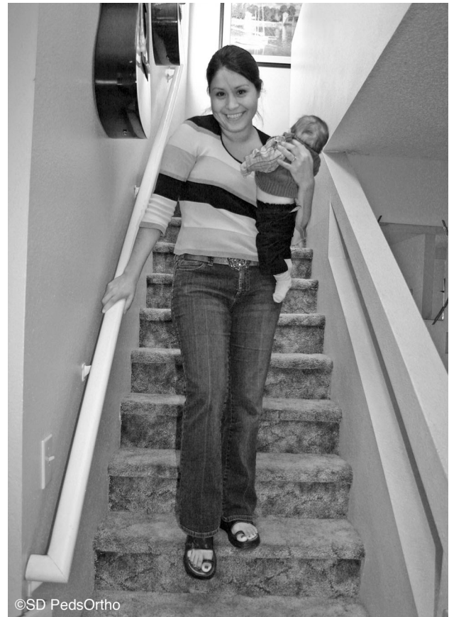
Fig. 3 The caregiver should hold on to the handrail while traversing the steps. In addition to using the handrail, the caretaker's view of the stairs should be unobstructed

Acknowledgments The authors would like to thank JD Bomar and Camila Avila-Bomar for their help with the drawings and photographs for this paper.