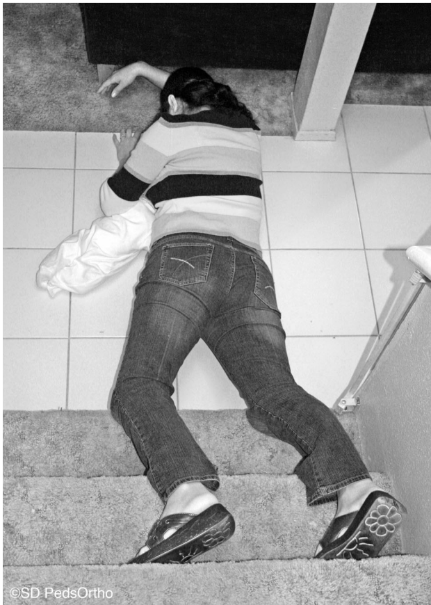
Fig. 2 They miss the step and fall, often landing on the child as they fall

on the opposite side of the body to the handrail. This ensures that the caretaker has a clear view of the steps. We hope that these recommendations serve to remind health-care providers as to the dangers of carrying children on stairways. At times this may be necessary, and can be performed safely if the proper precautions are taken.